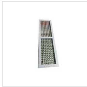
Double Louver Adjustable Grill