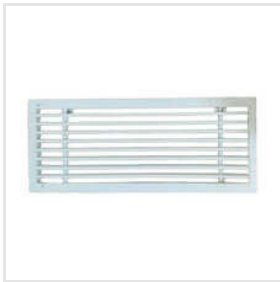
Linear Aluminium Linear Grill