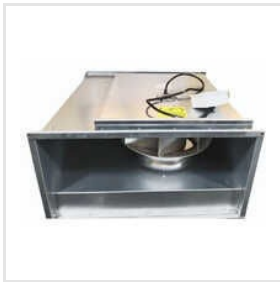
Rectangular Cabinet Inline Fan