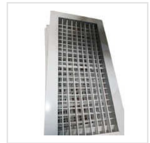
Double Deflection Linear Grill