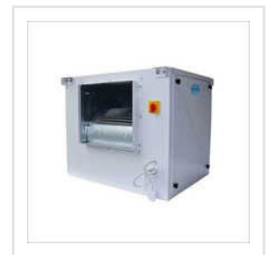
Industrial Cabinet Fan