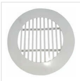
4inch Aluminium Round Linear Grill