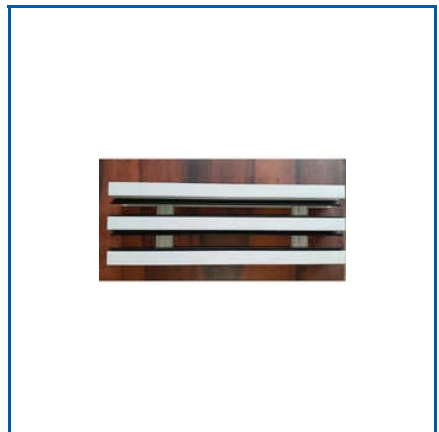
2 SLOT DIFFUSER