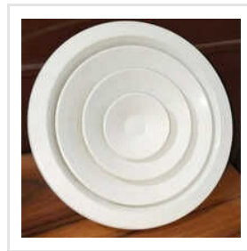
Air Round Diffusers