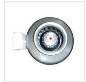
Inline Duct Fan