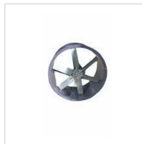
Tubeaxial Flow Fan