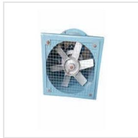
4inch Duct Fans