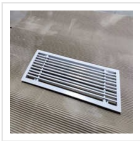
Duct Linear Grill