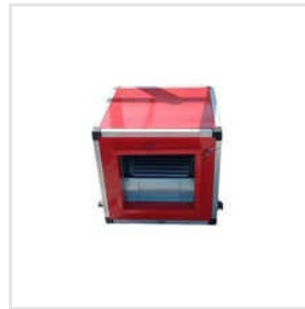
Cabinet Inline Fan