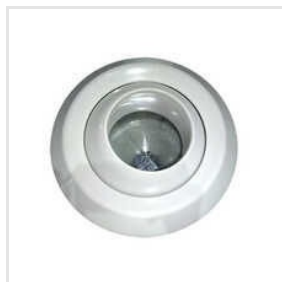
Jet Nozall- I Ball Diffuser