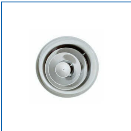
12INCH AIR JET DIFFUSERS

12inch Air Jet Diffusers, 12mm Aluminum Louvers, 2 Slot Diffuser, 316 Stainless Steel Duct Spigot, 4 mm Aluminium Pre Filter Pre Filter, 4inch Aluminium Round Linear Grill, 4inch Duct Fans, 8mm Galvanized Iron VCD, 950 CFM Inline Duct Fan, Air Round Diffusers, Aluminium Air Handling Unit Panel, Aluminium Air Pre Filter, Aluminium Round AC Grill, Aluminum Flexible Duct Pipe, Cabinet Inline Fan, etc.