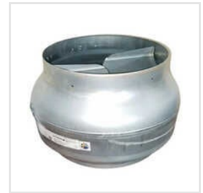
950 CFM Inline Duct Fan