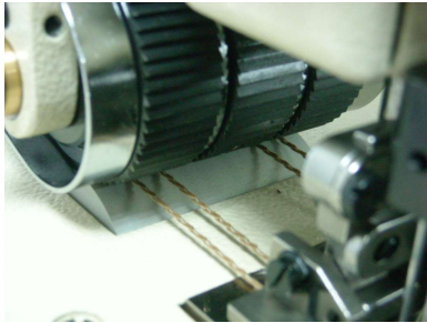
Metal upper puller and rubber lower puller