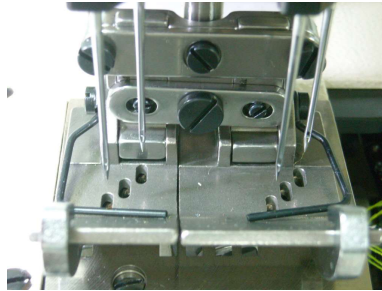
Split type presser foot