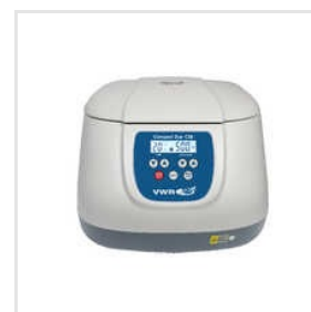
VWR CompactStar CS8 Centrifuge