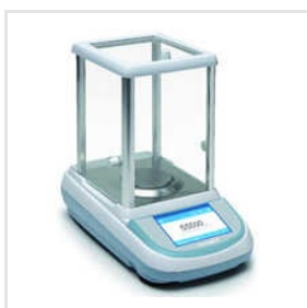
VWR TA Professional Analytical Balances