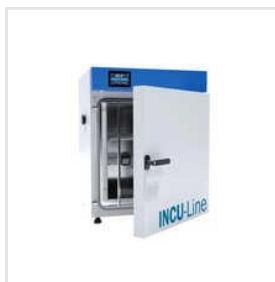
Avantor IL 56 Prime Incubators With