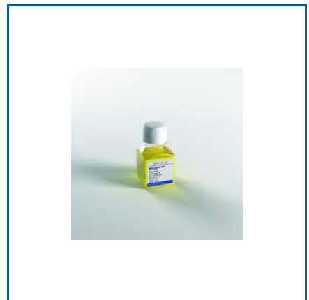
MEM VITAMINS 100X CONCENTRATE