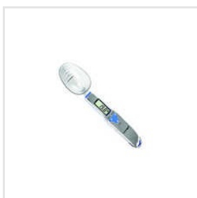
SpatulaBalance Portable Balance