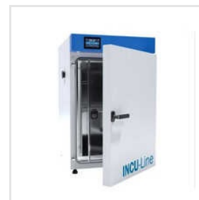
Avantor IL 180 Prime Incubators With