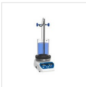
Magnetic Hotplate Stirrer