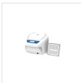
VWR Lab Centrifuge