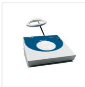
VWR MCC 2000 Manual Colony Counter