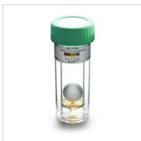
Microorganism Tests BART Ttest