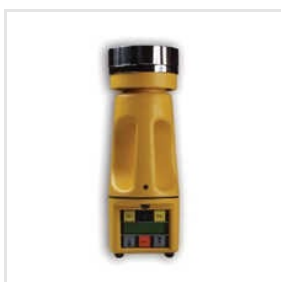
SAS Super 100 And 180 Air Samplers