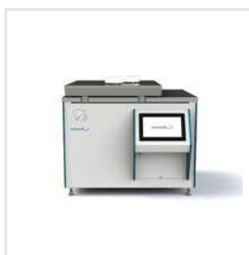
Media Preparator Premium 15 MPP15