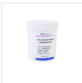
Bovine Serum Albumin Lyophilised PH-7