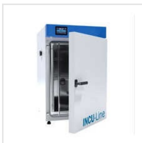
Dry Line Prime Drying Ovens