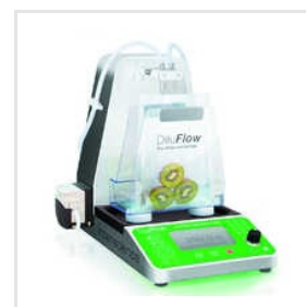
Digital Gravimetric Diluter