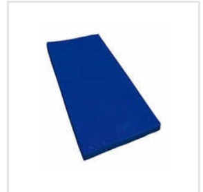
Sikhan Judo Mat