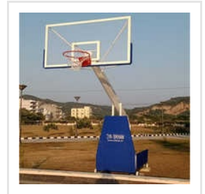
JM Tournament Basketball Pole