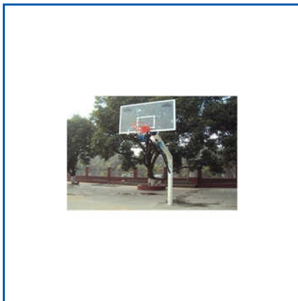
JM FORCE BASKETBALL POLE 6 IND ROUND FIX

Americas DX Table Tennis Table, Club Table Tennis Table, Crash Mat, International Table Tennis Table, JM Classic Basketball Pole 6 Inch Square Fix & Board Adjustable By Jack, JM Force Basketball Pole 6 Ind Round Fix, JM Movable Football Goal Post, JM Movable Handball Goal Post, JM Olympic Basketball Pole Moveable Manual Jack System, JM School Basketball Pole Moveable 6 Inch Round Pipe, etc.