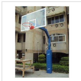
Jm Winner Basketball Pole 6 Inch Square Fix