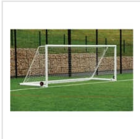
JM Movable Football Goal Post