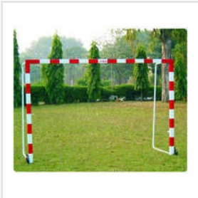
JM Movable Handball Goal Post