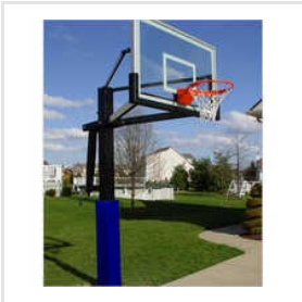
JM Classic Basketball Pole 6 Inch Square Fix &