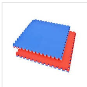
Sikhan Interlocking Mat