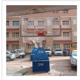
JM Olympic Basketball Pole Moveable Manual