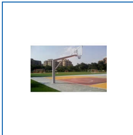
JM YOUTH BASKETBALL POLE 8 INCH ROUND FIX