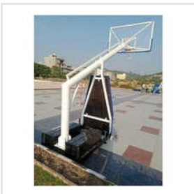
JM School Basketball Pole Moveable 6 Inch