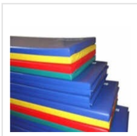
Sikhan Gymnastic Mat