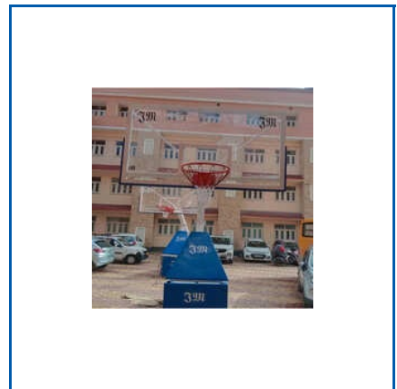
JM UNIVERSAL BASKETBALL POLE SPRING LOADED SYSTEM