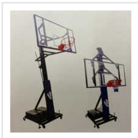
Jm All Rounder Basketball Pole