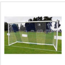
Jm Fix Football Goal Post