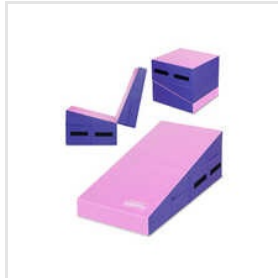
Sikhan Incline Mat