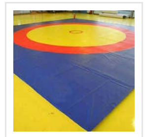
Sikhan Wrestling Mat Cover