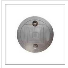
SFRC Manhole Cover