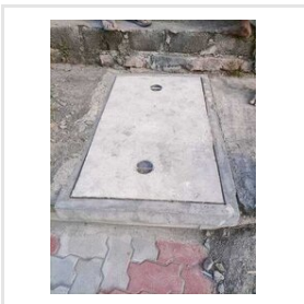
Precast Square Manhole Frames And