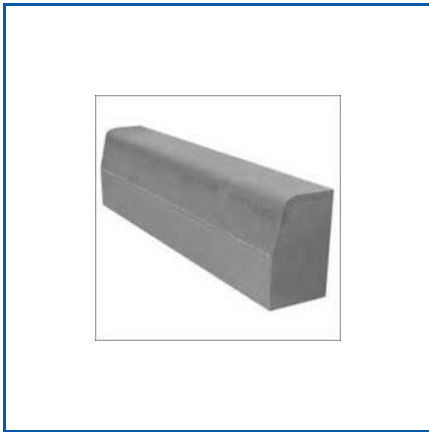
RCC KERB STONE

Big size Precast Valve Chambers, Precast Slabs, Precast Square Manhole Frames And Covers, Precast U Drain, Precast UGD Chambers, Precast Valve Chamber And Gummi, RCC Circular Drainage Cover, RCC Kerb Stone, RCC Round Manhole Chamber, RCC Square Drainage Cover, Round SFRC Manhole Cover, SFRC Manhole Cover, etc.