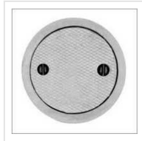
RCC Round Manhole Chamber