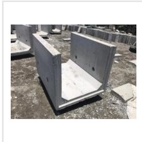
Precast U Drain