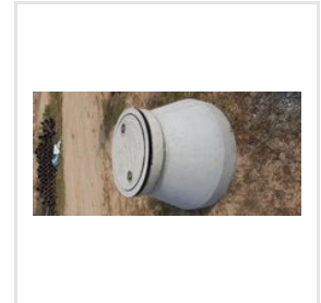
Precast Valve Chamber And Gummi