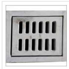
RCC Square Drainage Cover