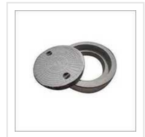
RCC Circular Drainage Cover