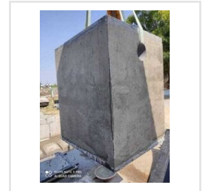
Big Size Precast Valve Chambers