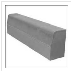
RCC Kerb Stone