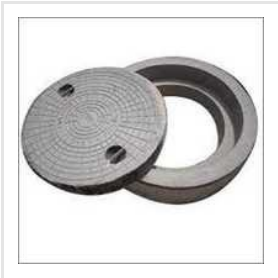
Round SFRC Manhole Cover