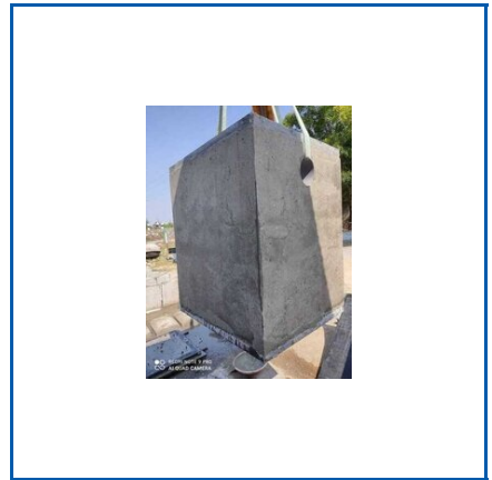
BIG SIZE PRECAST VALVE CHAMBERS