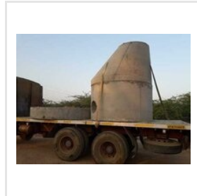
Precast UGD Chambers