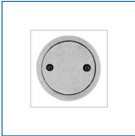
RCC ROUND MANHOLE CHAMBER