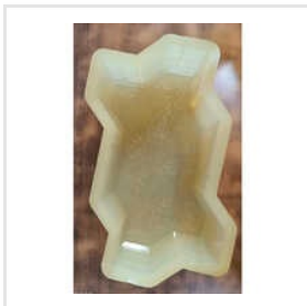
Zig Zag PVC Paver Mould