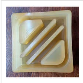
Breeze Block Moulds