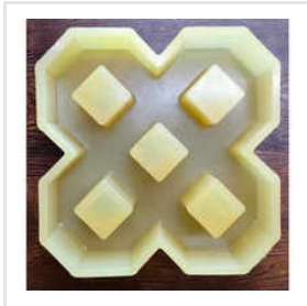
Grass PVC Paver Mould