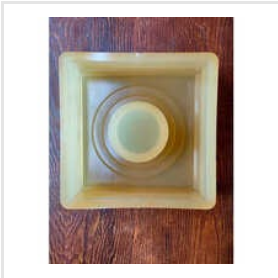
Breeze Block Mould