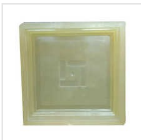
Square Elevation Mould