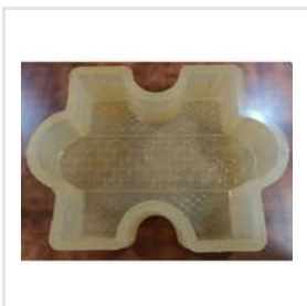
PVC Interlocking Paver Mould