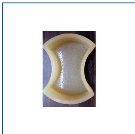
DAMRU PVC PAVER MOULD