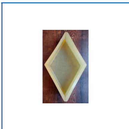
DIAMOND SHAPE PVC PAVER MOULD

50x60mm 12 Cavity Cover Block Mould, Apple Ventilation Mould, Arc Paving Block Mould, Big Colorado Tile Mould, Breeze Block Mould, Breeze Block Moulds, Chequered Tile Mould, Coloroda PVC Paver Mould, Damru PVC Paver Mould, Diamond Shape PVC Paver Mould, Flower Ventilation Mould, Ganesh Die Moulds, Grass PVC Paver Mould, I Dumble PVC Paver Mould, Industrial Pan Mixer Machine, etc.