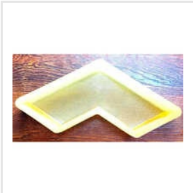
L Shaped PVC Paver Mould