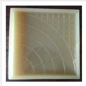
PVC Tile Mould