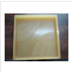
Chequered Tile Mould