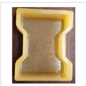
I Dumble PVC Paver Mould