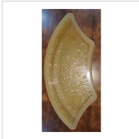
Arc Paving Block Mould