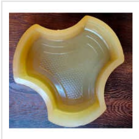
Big Colorado Tile Mould