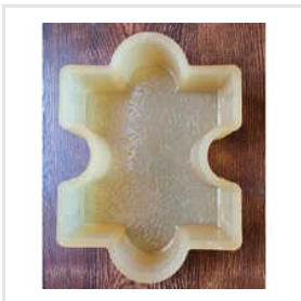
PVC Paving Block Mould