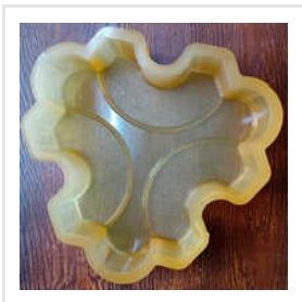
Taurus PVC Paver Mould