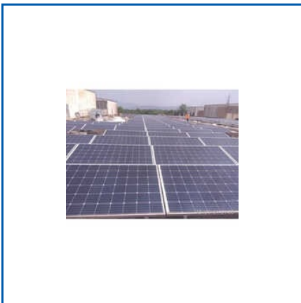
SOLAR ROOFTOP ON GRID INSTALLATION SERVICE