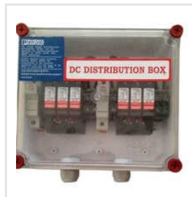
DC Distribution Box