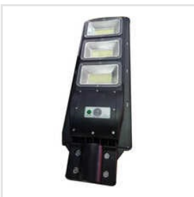
20W Solar Street Light