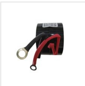
Ring Type Current Transformer