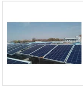
Commercial Solar Rooftop Installation