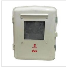
KMW Meter Box