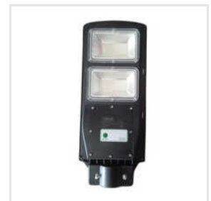
30W Solar Street Light