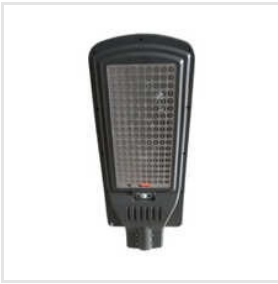
65 Watt Solar Street Light