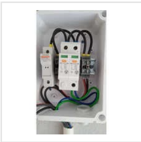
AC Distribution Box