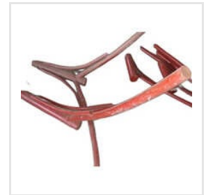
MS Street Light Arm Pole