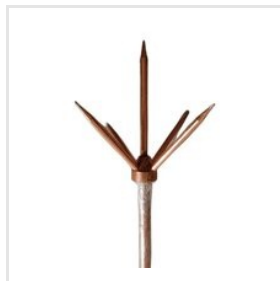
Electric Lightning Arrestor