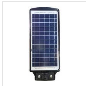
60W Solar LED Street Light