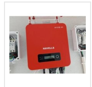
Electric Grid Tie Inverter