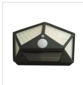
2W Solar Interaction Wall Lamp