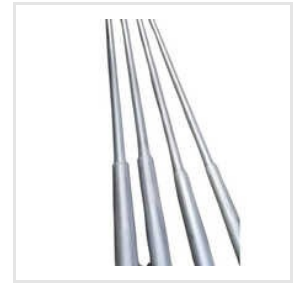
MS Street Light Pole