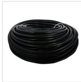
AC Copper Cable