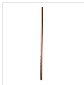
Copper Earthing Electrode Rod