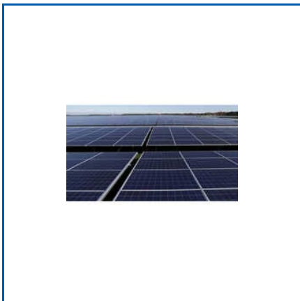
COMMERCIAL OFF GRID SOLAR ROOF TOP INSTALLATION SERVICE