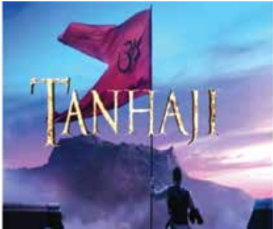
Flag Size: 4x6inch, 6x9inch, 12x18inch or any custom size