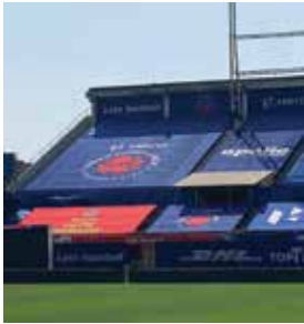
FABRIC STADIUM BRANDING