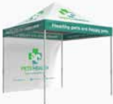
Top Branding + Backwall