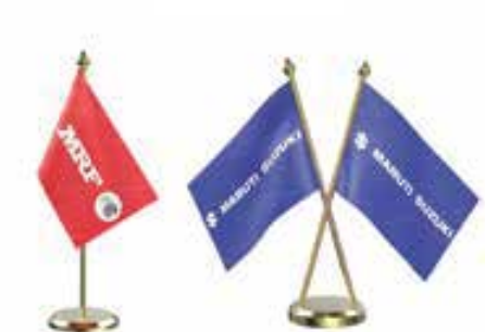
Single Cross Size: 4x6 in, 6x9 in, 8x12 in