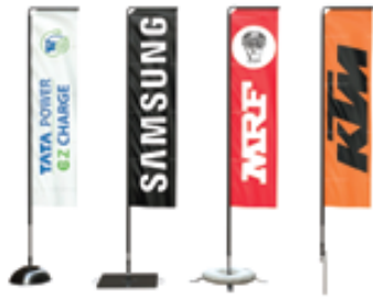
DOM BASE BASE PLATE X BASE & Water Bag SPIKE BASE Flag Size: 6ft, 8ft, 12ft, 16ft