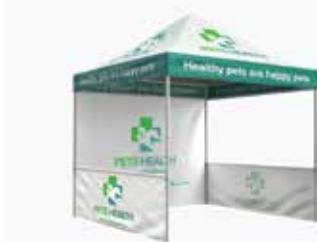
Top Branding + Backwall + 2 Side Half Walls