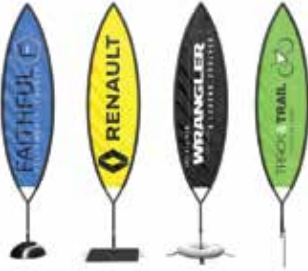
DOM BASE BASE PLATE X BASE & Water Bag SPIKE BASE Flag Size: 12ft, 16ft