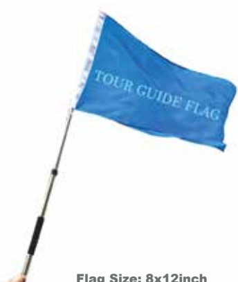
Flag Size: 8x12inch