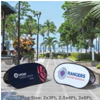
Flag Size: 2x3Ft, 2.5x4Ft, 3x6Ft,