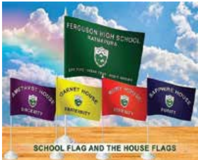
Flag Size: 4x6inch, 6x9inch, 12x18inch 2x3ft, 3x4.5ft, 4x6ft, 6x9ft, 8x12ft or any custom size