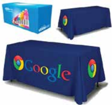
Flag Size: any custom size