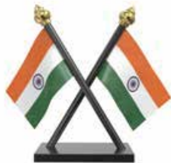
Flag Size: 2x3 inch, 4x6 inch or any custom size