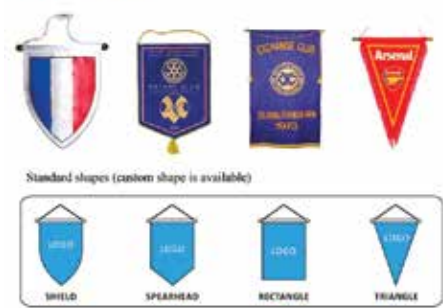
Flag Size: 4x6inch, 6x9inch, 12x18inch or any custom size