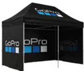
Top Branding + Backwall + 2 Full Walls