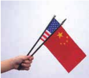
Flag Size: 4x6inch, 6x9inch, 12x18inch 2x3ft, 3x4.5ft, 4x6ft, 6x9ft, 8x12ft or any custom size