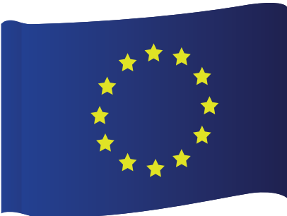
Flag Size: 4x6inch, 6x9inch, 12x18inch 2x3ft, 3x4.5ft, 4x6ft, 6x9ft, 8x12ft or any custom