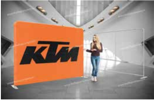
Flag Size: 6x6ft, 8x8ft, 10x8ft any custom size