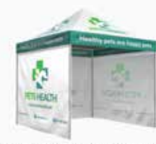
Top Branding + Backwall + 2 Full Walls