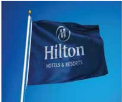
Flag Size: 4x6inch, 6x9inch, 12x18inch 2x3ft, 3x4.5ft, 4x6ft, 6x9ft, 8x12ft or any custom size