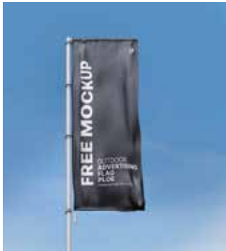
Flag Size: 12x18inch, 2x3ft, or any custom size