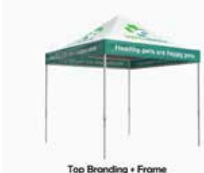
Top Branding + Frame