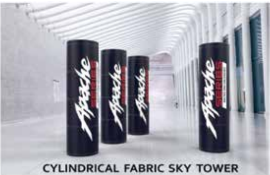
CYLINDRICAL FABRIC SKY TOWER