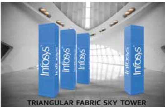
TRIANGULAR FABRIC SKY TOWER