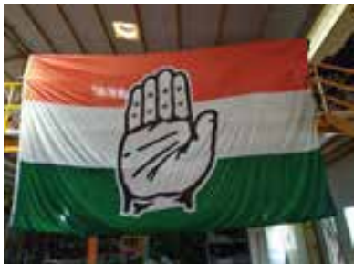
Flag Size: 8x12ft,12x18ft,20x30ft 30x45ft,60x90ft or any custom size