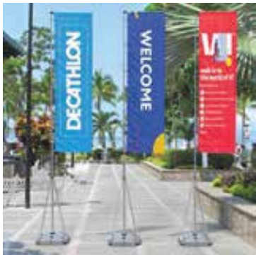
Flag Size: 6ft, 8ft, 12ft, 16ft