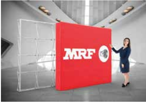
Flag Size: 7.5x7.5ft