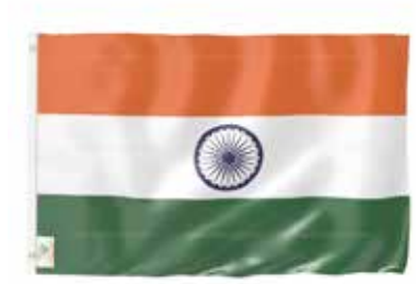
Flag Size: 4x6inch, 6x9inch, 12x18inch 2x3ft, 3x4.5ft, 4x6ft, 6x9ft, 8x12ft or any custom