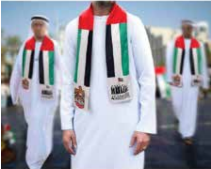
Size: 6x72inch, 6x65inch or any custom size