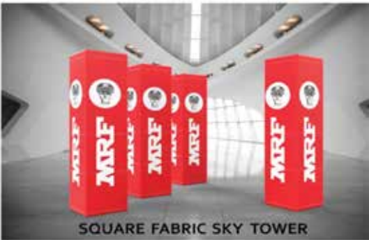
SQUARE FABRIC SKY TOWER