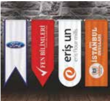
Flag Size: 4x6inch, 6x9inch, 12x18inch 2x3ft, 3x4.5ft, 4x6ft, 6x9ft, 8x12ft or any custom size