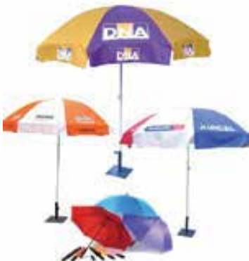
UMB Size: 36inch, 42inch, 48inch