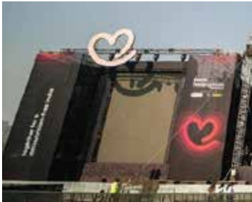
SCRIM CLOTH - SPEAKER BRANDING