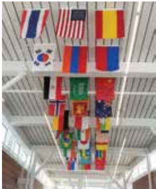
Flag Size: 12x18inch, 2x3ft, any custom size