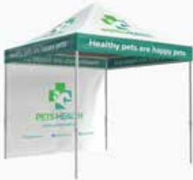
Top Branding + Backwall