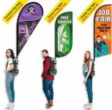
Flag Size: 6ft