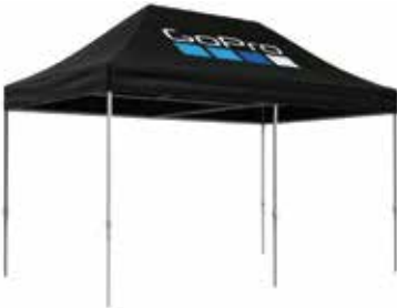
Top Branding + Frame