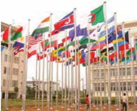
Pole Size: 4Ft, 6Ft, 8Ft, 10Ft,15Ft, 20Ft, 25ft