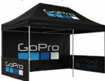
Top Branding + Backwall + 2 Side Half Walls