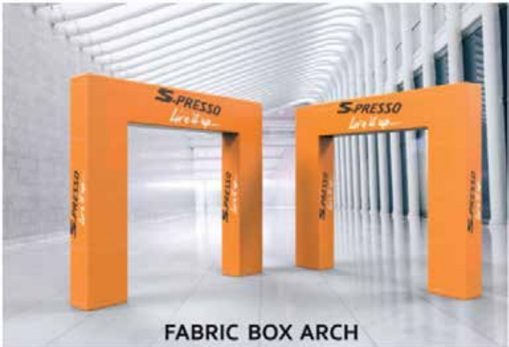
FABRIC BOX ARCH