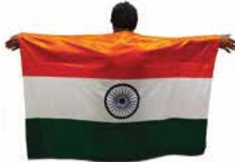
Flag Size: 3x4.5ft, 4x6ft or any custom size