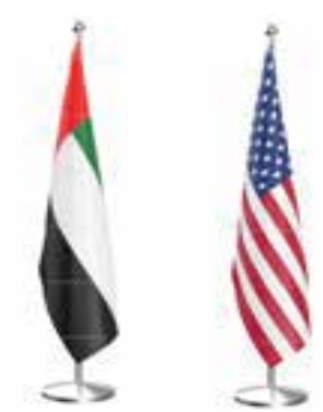
Pole Size: 4Ft, 6Ft, 8Ft, 10Ft