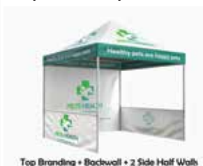
Top Branding + Backwall + 2 Side Half Walls