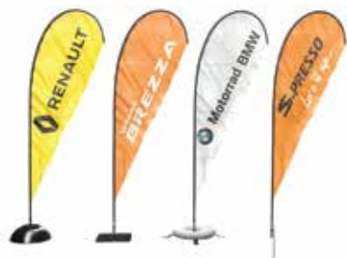
DOM BASE BASE PLATE X BASE SPIKE BASE Flag Size: 6ft, 8ft, 12ft, 16ft