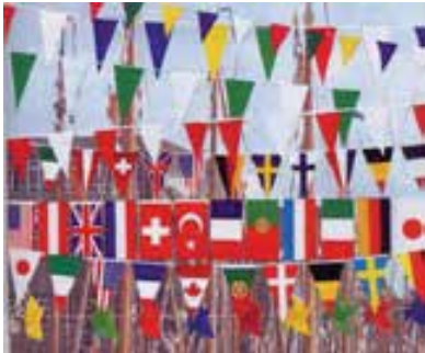
Flag Size: 4x6inch, 6x9inch, 12x18inch or any custom size