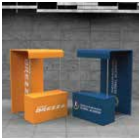
POP UP FABRIC KIOSK