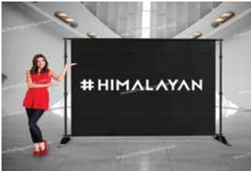
Flag Size: 6x6ft, 8x8ft, 10x8ft