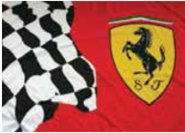
Flag Size: 4x6inch, 6x9inch, 12x18inch 2x3ft, 3x4.5ft, 4x6ft, 6x9ft, 8x12ft or any custom