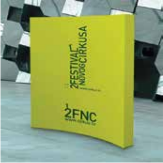
Flag Size: 7.5x7.5ft