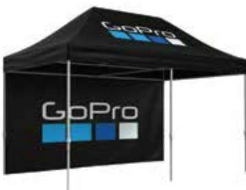
Top Branding + Backwall