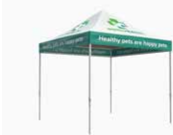
Top Branding + Frame