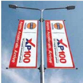
Flag Size: 2x3ft, 2x4ft, 3x6ft, 3x8ft,4x8ft,