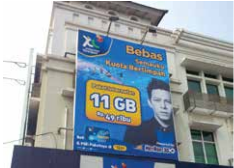
Banner Size_ 10x15Ft, 20x30Ft, 30x45ft or any custom