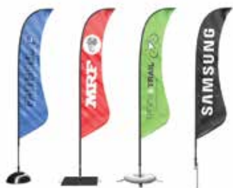
DOM BASE BASE PLATE X BASE & Water Bag SPIKE BASE Flag Size: 6ft, 8ft, 12ft, 16ft