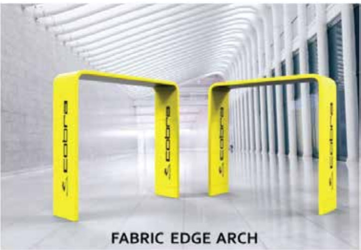
FABRIC EDGE ARCH