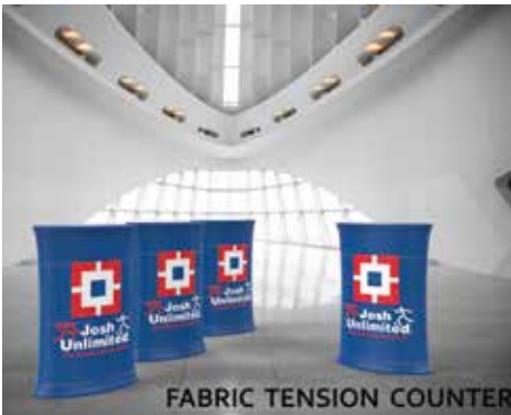
FABRIC TENSION COUNTER