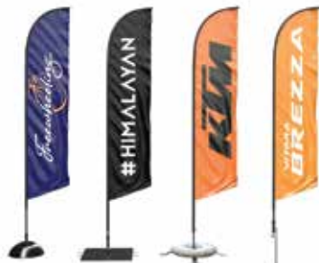
DOM BASE BASE PLATE X BASE SPIKE BASE