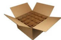
BROWN 3 PLY CORRUGATED BOX