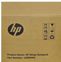
HP Wings Backpack Packaging Box