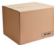
3 PLY CORRUGATED BOXES