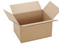
5 Ply Corrugated Box