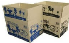
Flexo Printing Corrugated Box