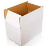
Plain 3 Ply Corrugated Boxes