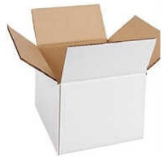
Rectangular Single Wall 3 Ply Corrugated