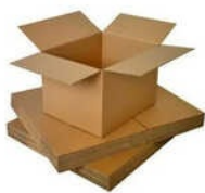
20X20X20 INCH 3 PLY CORRUGATED BOXES

20x20x20 inch 3 Ply Corrugated Boxes, 3 Ply Corrugated Boxes, 5 Ply Corrugated Box, Brown 3 Ply Corrugated Box, Corrugated Packaging Box, Customized Fruit Packaging Box, Duplex Box, Flexo Printing Corrugated Box, HP Wings Backpack Packaging Box, Plain 3 Ply Corrugated Boxes, Printed Corrugated Packaging Box, Rectangular Brown Corrugated Box, Rectangular Single Wall 3 Ply Corrugated Box, Square Corrugated Carton Box, TV PRINTING BOX, etc.