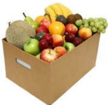
Customized Fruit Packaging Box