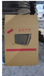
TV PRINTING BOX