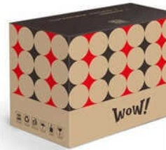
Printed Corrugated Packaging Box