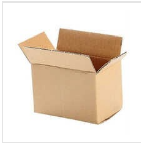
Rectangular Brown Corrugated Box