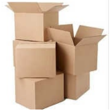
Corrugated Packaging Box