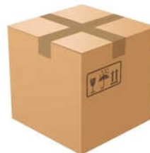
Square Corrugated Carton Box