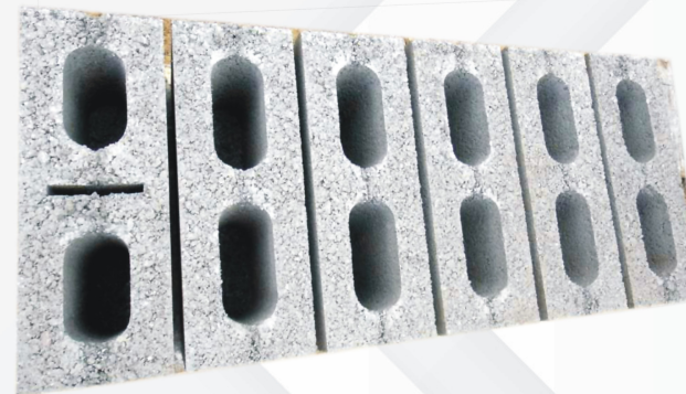
HOLLOW CONCRETE BLOCK