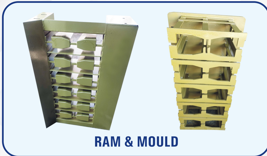
RAM & MOULD