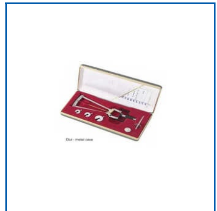
BIRO SCHIOTZ TONOMETER