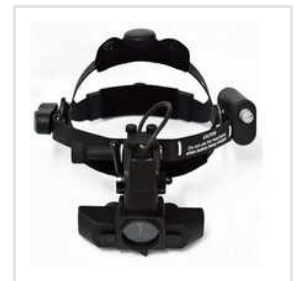
Care Vision Indirect Ophthalmoscope