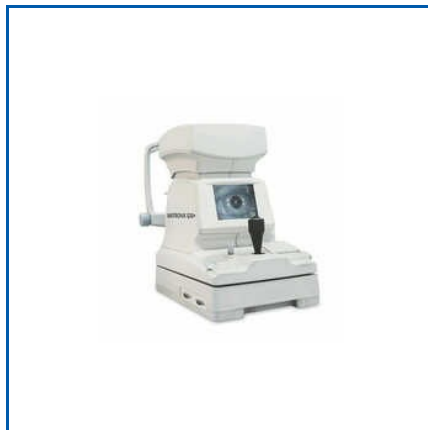
AUTO REFRACTOMETER Q30