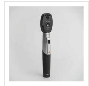
Heine Mini 3000 Pocket Ophthalmoscope