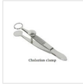
Surgical Chalazion Clamps