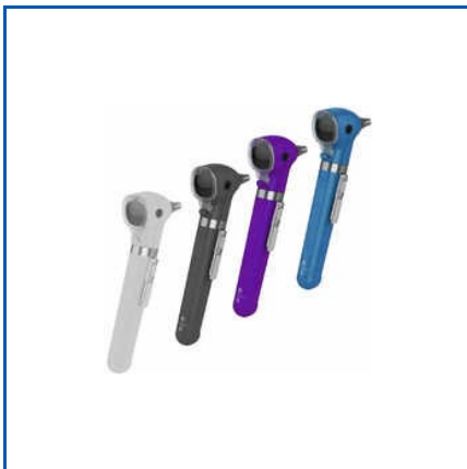
WELCH ALLYN POCKET OTOSCOPE

2 Mirror Lens, AR800 Justice Auto Refractometer, AR800 Justice Auto Refractometer, AR810A Justice Auto Refractometer, Arcylic Chart-Care Vision012, Auto Lensmeter Matronix Slk 5600, Auto Refractometer Justice Ar 800a, Auto Refractometer Q30, Auto Refractometer R20 Plus, Autorefractor Keratometer, Barraquer Wire Eye Speculum Stainless Steel (Small), Biro Schiottz Tonometer, Blood Pressure Monitor, CV 66 Trial Lens Set Red Black 226 Lens With Metal Rim Lens Set, CV-123 Slit Lamp Motorized Table, etc.