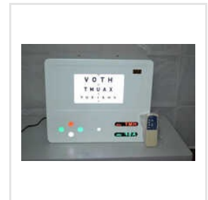
Care Vision Remote Control Distance Vision