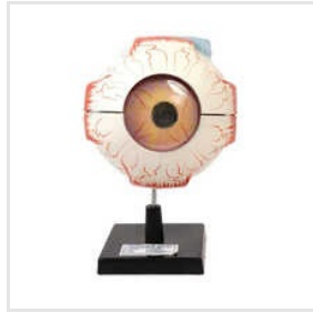
Demo Eye Care Vision