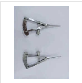
Care Vision Ophthalmic Caliper