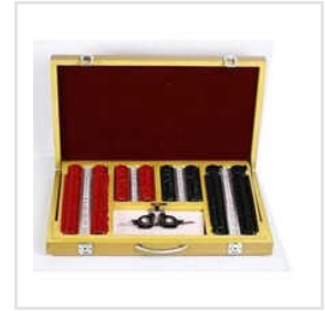
Care Vision Trial Lens Set Red Black 226 Lens