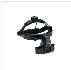
Care Vision Wireless Indirect