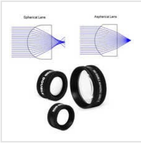
Care Vision 78D Double Aspheric Lens