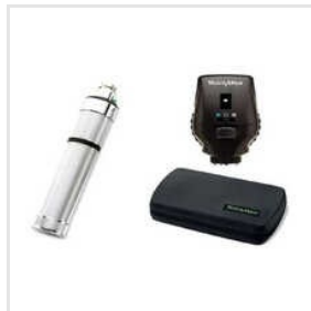
Welch 3.5V Allyn Ophthalmoscope