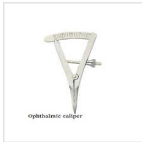
MS102 Ophthalmic Caliper