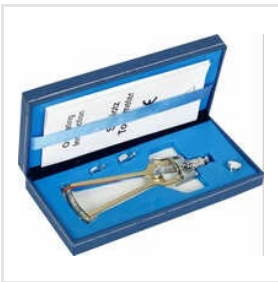
Care Vision Schiotz Tonometer