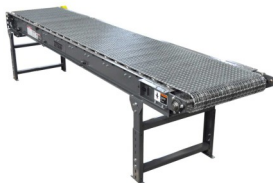
Wire Mesh Belt Conveyor