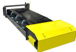
Through Belt Conveyor