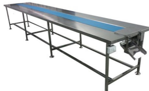
Packing Belt Conveyor