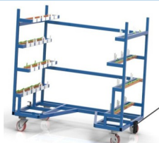
Material Handling Trolleys

Application : Assembly line Operations | Material Sorting | Packing | Inspection System | Cartoon Movement Coal & Cement Handling | Bulk Material Transfer | Food Processing