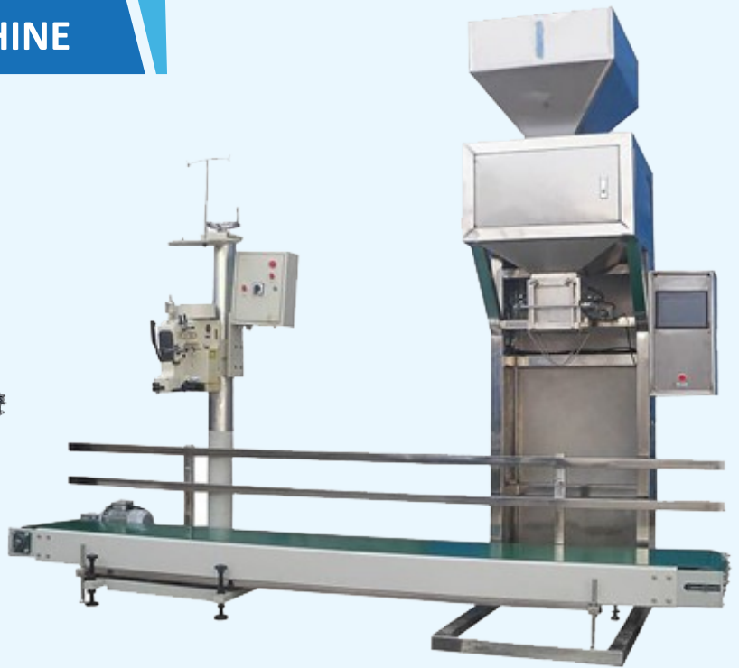
10 to 50 Kg. Bagging Machine

Our 2 Load Cell based Electronic, net weighing and bagging machines are suitable to bag free flowing granular material more accurately and reliability in open mouth bags.