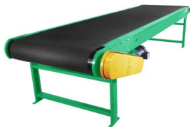
Flat Belt Conveyor