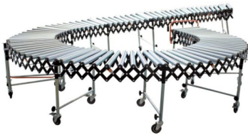
Flexible Roller Conveyor