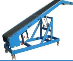
Truck Loading Conveyor