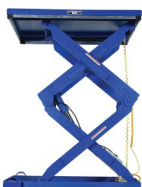
Scissor Lift (0.5 to 5 ton)