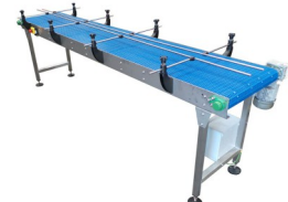
Modular Belt Conveyor