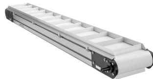
Cleated Belt Conveyor