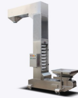
Z type Bucket Elevator