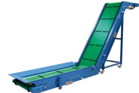
Inclined Belt Conveyor