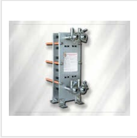
Plate Heat Exchanger EHTS