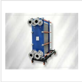
High Performance Widegap Plate Heat