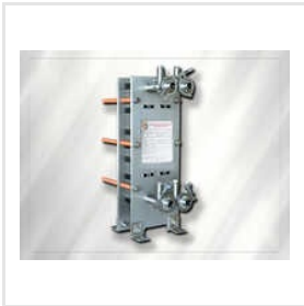
Sanitary Plate Heat Exchangers