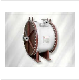
Spiral Heat Exchangers By EHTS