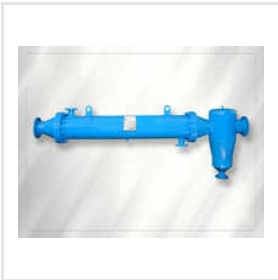
Industrial Evaporators Evaporative