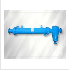
Shell And Tube Heat Exchangers Heat