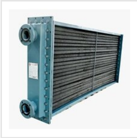
Air Fin Air Finned Finned Tube Heat