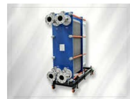
HIGH PERFORMANCE WIDEGAP PLATE HEAT EXCHANGERS