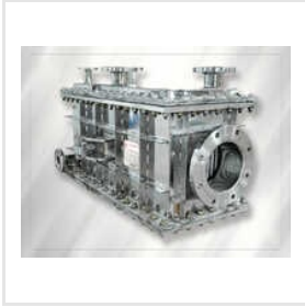
Block And Box Type Heat Exchangers