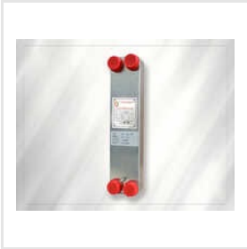
High Performance Brazed Plate Heat