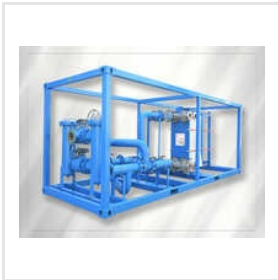
EHTS Heat Exchanger Systems