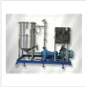
Cleaning In Place Systems