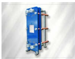
INDUSTRIAL SANITARY PLATE HEAT EXCHANGERS

Air Fin Air Finned Finned Tube Heat Exchangers, Block And Box Type Heat Exchangers, Cleaning In Place Systems, EHTS Heat Exchanger Systems, Effluent Water Treatment Plants, High Performance Brazed Plate Heat Exchangers, High Performance Widegap Plate Heat Exchangers, Industrial Evaporators Evaporative Condensers, Industrial Sanitary Plate Heat Exchangers, Plate Heat Exchanger EHTS, Sanitary Plate Heat Exchangers, Shell And Tube Heat Exchangers Heat Condensers, Spiral Heat Exchangers by EHTS, etc.