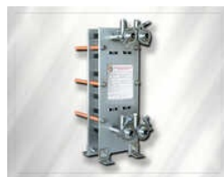
SANITARY PLATE HEAT EXCHANGERS