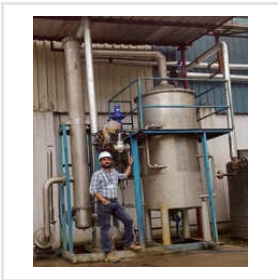
Effluent Water Treatment Plants