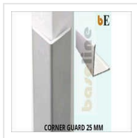
25 Mm Aluminium Corner Guard L Angle