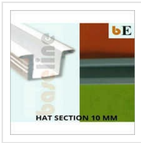
10 Mm Aluminium HAT Section