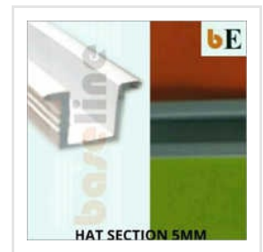
5 MM Aluminium HAT Section - U Channel