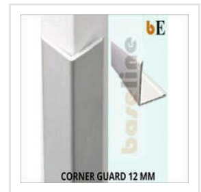
12 MM Aluminium Corner Guard L Angle