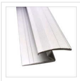
Aluminium Transition Carpet