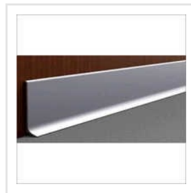
80 Mm Aluminium Skirting Profile