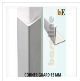
15 MM Aluminium Corner Guard L Angle