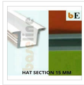
15 Mm Aluminium HAT Section - U Channel