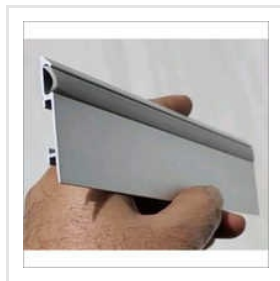
50 MM Aluminium Skirting Profile