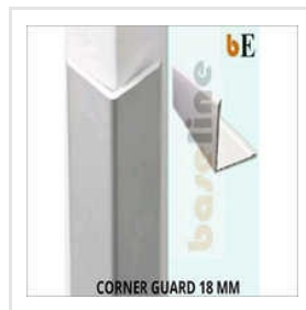
18 Mm Aluminium Corner Guard L Angle