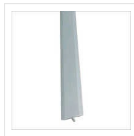
Aluminium Transition Carpet