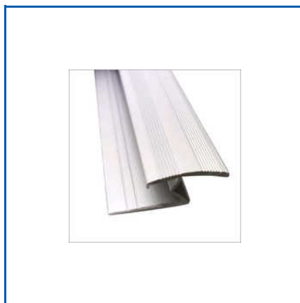
ALUMINIUM TRANSACTION CARPET AND Z PROFILE