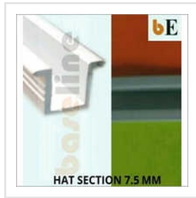
7.5 MM Aluminium HAT Section - U Channel