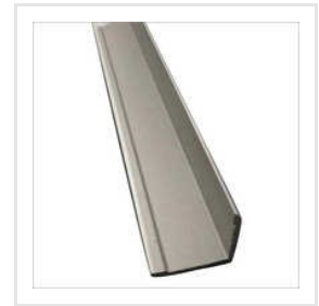
9 Feet Aluminium Corner Guard L Angle