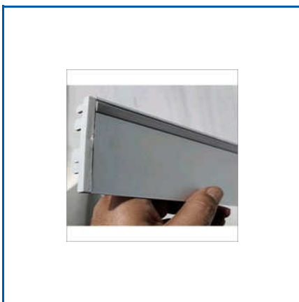
75 MM ALUMINIUM SKIRTING PROFILE