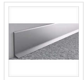
60 Mm Aluminium Skirting Profile