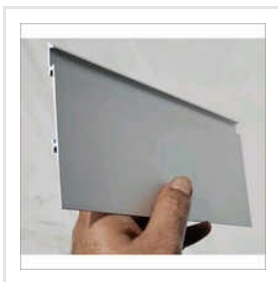
100 Mm Aluminium Skirting Profile