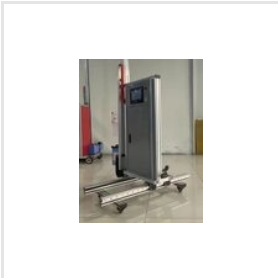
MJ 2000 X1 Wall Printing Machine