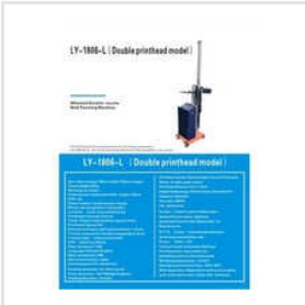
GUPV LY1806-L Wall Painting Machine