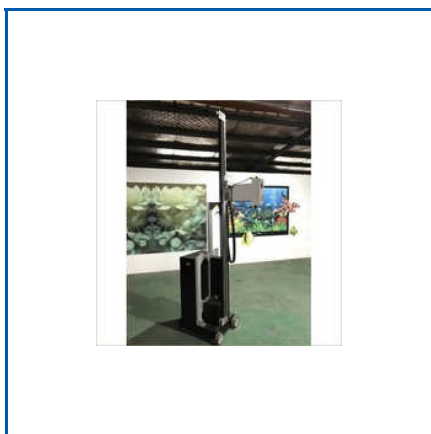
WHEEL BASED VERTICAL WALL PRINTING MACHINE

GVP -MJ-2000-X3-UV-CMYK, GVP LY1806-L Wall Painting Machine, GVP-ALF-IP9-S25 AI4K-H32, GVP-ALF-IP9-S25 AI4K-H64, GVP-ALF-IP9-S25-AI4K-H32 SYN, GVP-ALF-IP9-S25-AI4K-H64 SYN, GVP-MJ 2000 X1 - UV-CMYK, GVP-MJ 2000-X2-UV-CMYK, MJ 2000 X1 Wall Printing Machine, Wall Printer, Wheel Based Vertical Wall Printing Machine, etc.