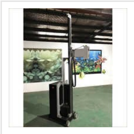
Wheel Based Vertical Wall Printing Machine