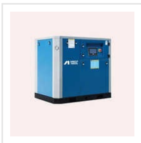
100 HP APM Series Screw Compressor