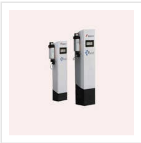
Desiccant Air Dryer