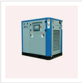
100 HP Series Screw Compressor