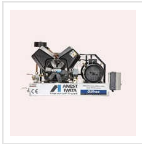
5 HP Oli Free Air Compressor