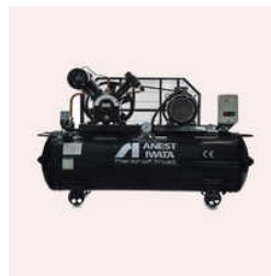
5 HP LUBRICATED AIR COMPRESSOR