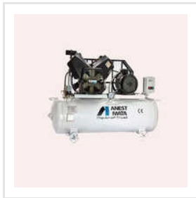
1 HP Oli Free Air Compressor