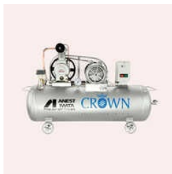
1 HP LUBRICATED AIR COMPRESSOR

1 HP Lubricated Air Compressor, 1 HP Oli Free Air Compressor, 1 Inch EVO Series Metallic Electric Diaphragm Pump, 10 HP Tank Mounted Screw Compressor, 10 HP Tank Mounted Vacuum Pump, 100 HP APM Series Screw Compressor, 100 HP Series Screw Compressor, 15 HP High Pressure Air Compressor, etc.