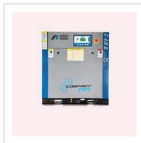
50 HP Belt Driven Screw Compressor