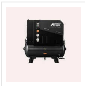
10 HP Tank Mounted Screw Compressor