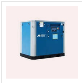
100 HP APM Series Screw Compressor