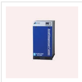
5 HP Scroll Air Compressor