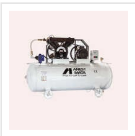
10 HP Tank Mounted Vacuum Pump