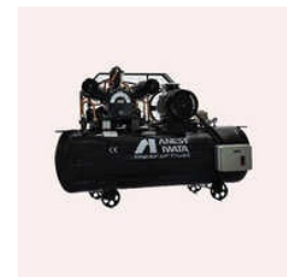
15 HP HIGH PRESSURE AIR COMPRESSOR