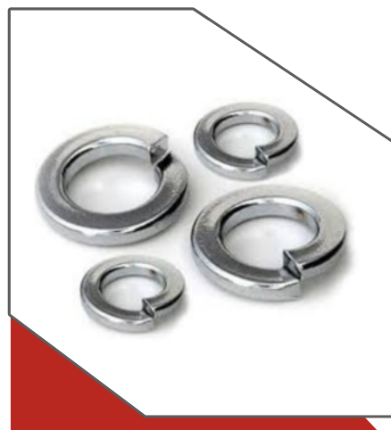
WASHERS DIN 127