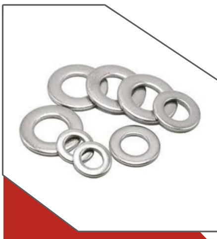
WASHERS DIN 125