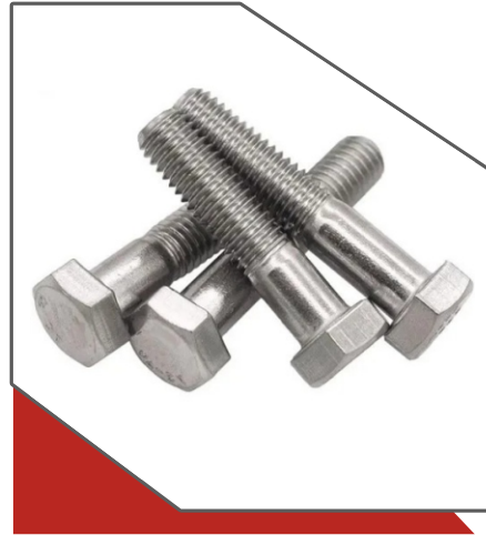
HEX BOLTS DIN 933