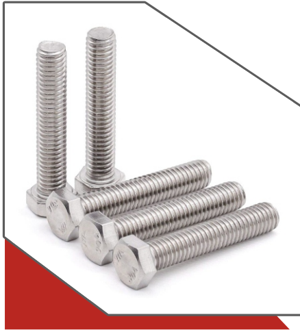
HEX BOLTS DIN 931