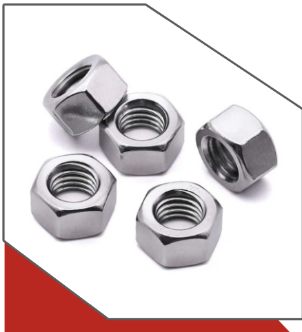
HEX NUTS DIN 934