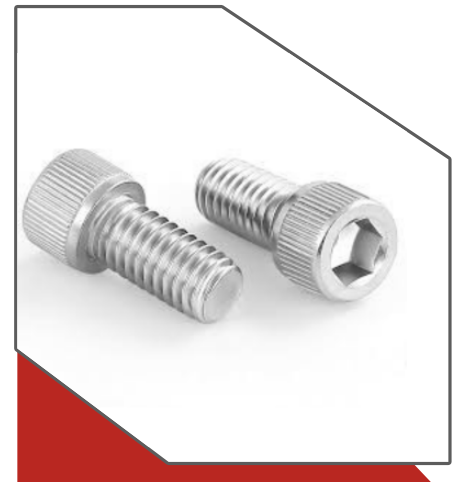
ALLEN BOLTS DIN 912