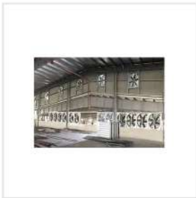
GREENHOUSE AXIAL FAN