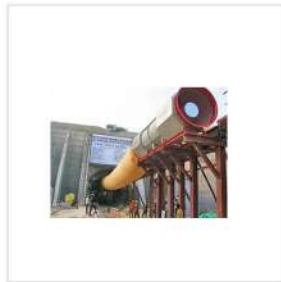
TUNNEL FAN FOR ROAD AND HIGHWAY