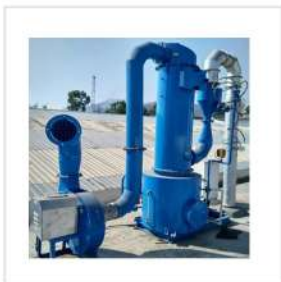
VENTURI FUME SCRUBBER