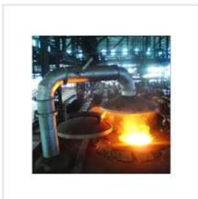
AOD FURNACES FUME EXTRACTION