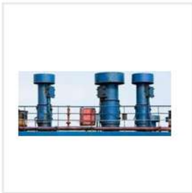
MARINE MUSHROOM VENTILATION FAN