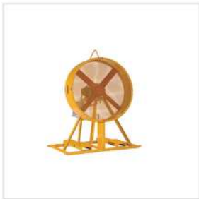
FLAMEPROOF BUG BLOWER FAN