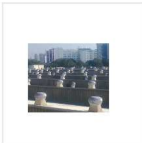
TRV-24 TURBO VENTILATOR FAN