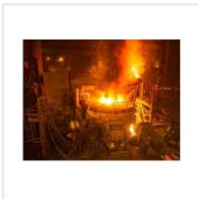
ARC FURNACE FUME EXTRACTION SYSTEMS