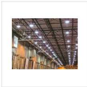
SOLATUBE DAY LIGHTING SKYLIGHT