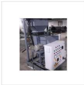
HOT AIR BLOWER