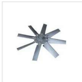
ALUMINIUM CASTING IMPELLER FAN