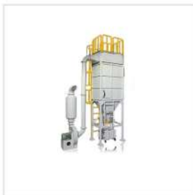
PULSE JET DUST COLLECTOR