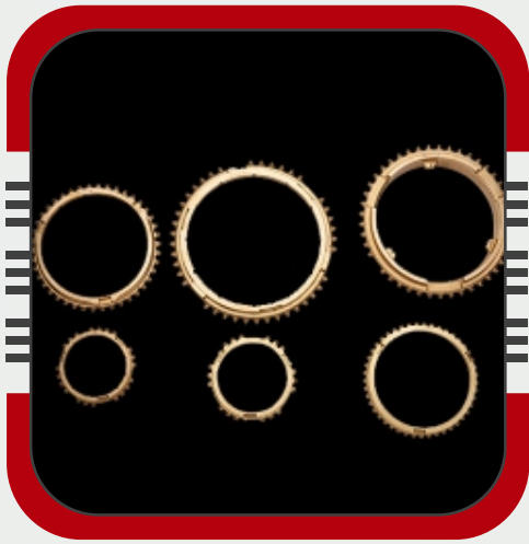
Brass Synchronizer Rings