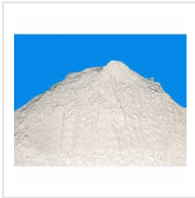
Actigel Attapulгите 30