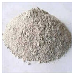
Acid Activated Bentonite