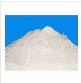
Actigel Attapulгите 50