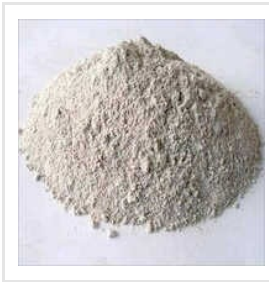
Bleaching Earth Powder