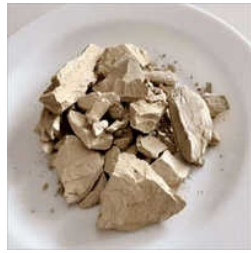
Earth Fuller Lump