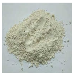
WHITE ATTAPULGITE POWDER