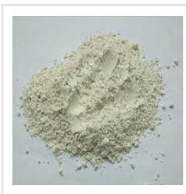
White Attapulгите Powder