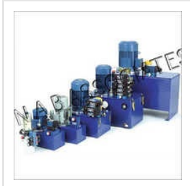
Hydraulic Power Pack