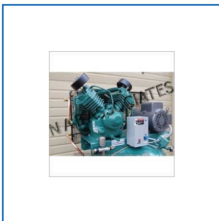
RECIPROCATING AIR COMPRESSORS

EPS Cup Making Machine, EPS Filling Gun, EPS Foam Moulds, Fully Auto Hydraulic Shape Moulding Machine, Fully Auto Shape Moulding Machine, Hydraulic Power Pack, Ice Gel Pack, Reciprocating Air Compressor, Spring Applied Pneumatic Brake, Thermocol Block Moulding Machine, Thermocol Ice Box, Thermocol Preforming Machine, etc.