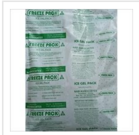
Ice Gel Pack