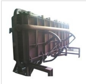
Thermocol Block Moulding Machine