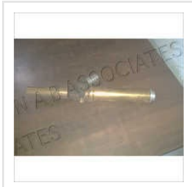
EPS Filling Gun