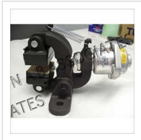
Spring Applied Pneumatic Brake