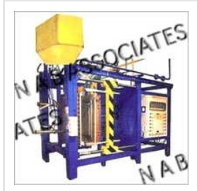
Fully Auto Shape Moulding Machine