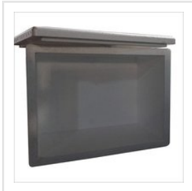
Thermocol Ice Box