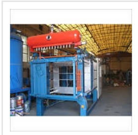
Fully Auto Hydraulic Shape Moulding