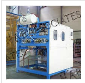
EPS Cup Making Machine