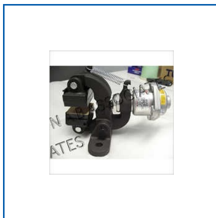
SPRING APPLIED PNEUMATIC BRAKE