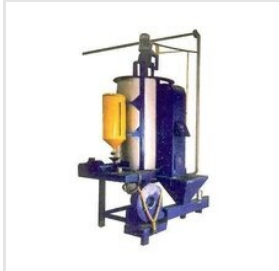
Thermocol Preforming Machine