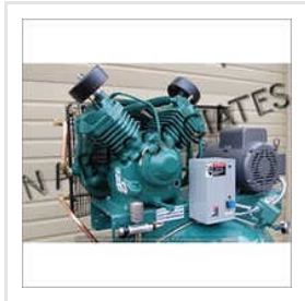
Reciprocating Air Compressor