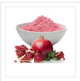
Pink Pomegranate Powder