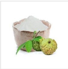
Custard Apple Powder