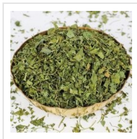
Green Kasuri Methi Leaves