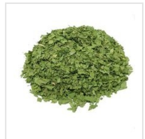
Dried Coriander Leaves