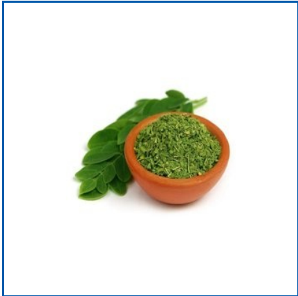
MORINGA DRIED LEAVES

Amla Powder, Apple Powder, Banana Powder, Barbeque Seasoning Powder, Cheese Food Seasoning Powder, Cheese Powder, Chikoo Powder, Cinnamon Powder, Coconut Milk Powder, Cream And Onion Food Seasoning Powder, Curry Leaf Powder, Custard Apple Powder, Dehydrated Beetroot Powder, Dehydrated Dhaniya Patta Powder, Dehydrated Garlic Flakes, etc.