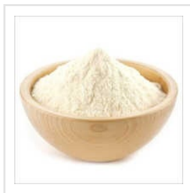
White Cheese Powder