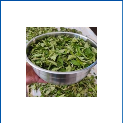
ORGANIC DRY CURRY LEAVES