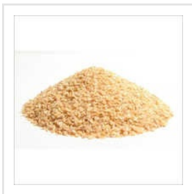
Dehydrated Garlic Granules