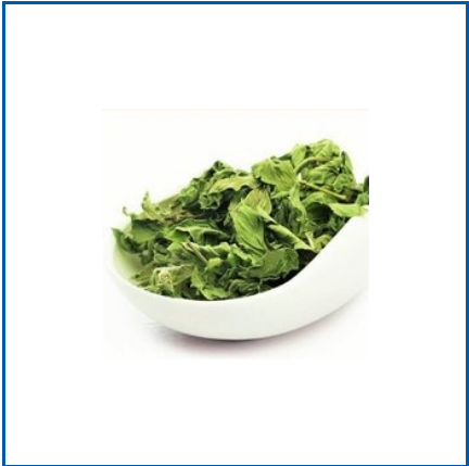
DRIED MINT LEAF