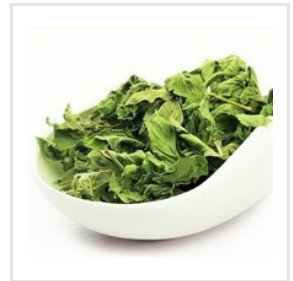
Dried Mint Leaf