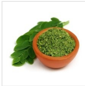
Moringa Dried Leaves