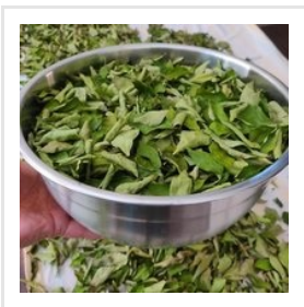
Organic Dry Curry Leaves