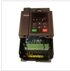
VFD 7.5KW Frecon Three Phase Drive