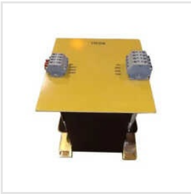
1 KVA Power Transformer