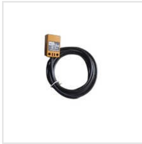
KPTech N8G36R1K Inductive Proximity