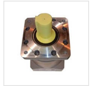
Planetary Gear Box