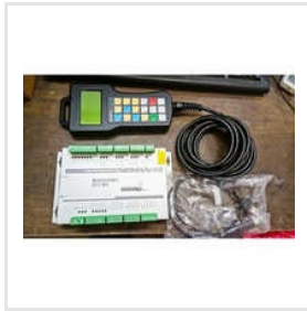
Weihong Nk105 G2 Controller