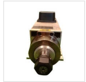
HQD Air Cooled CNC Spindle