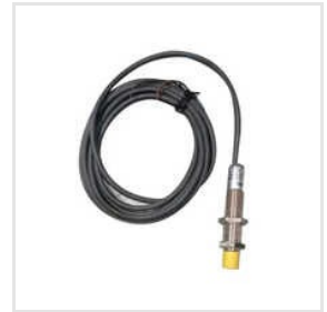
36V Inductive Proximity Sensor