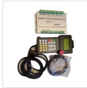
Weihong NK105 CNC Controller System