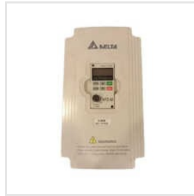
Delta AC Servo Drive