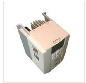
7.5 KW 220 V Delta Variable Frequency