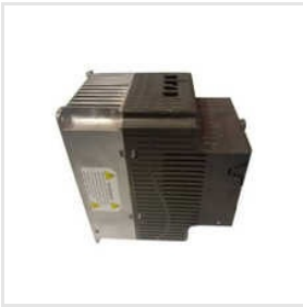
3.4 KW Delta VFD Drive