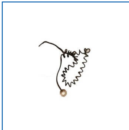
AUTO FOCUS LASER SENSOR