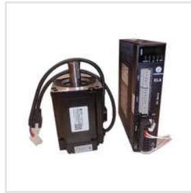
Leadshine EL6 AC Servo Drive