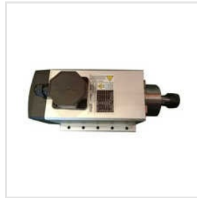
HQD 3.5kW Air Cooling Spindle