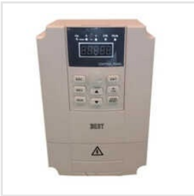
VFD Control Panel