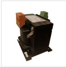
500 KVA Power Transformer