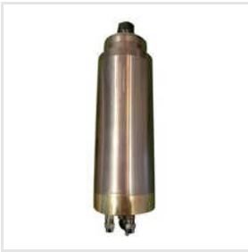
3.2 KW Water Cooling Spindle