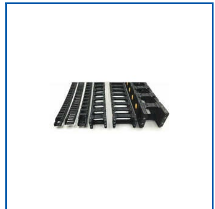
HSSP SERIES ROBO CHAIN