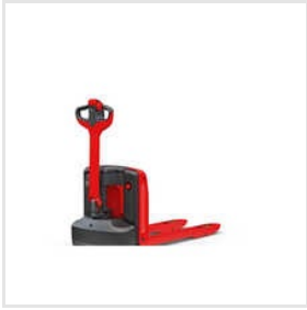
MT 20 Linde Battery Operated Pallet Truck