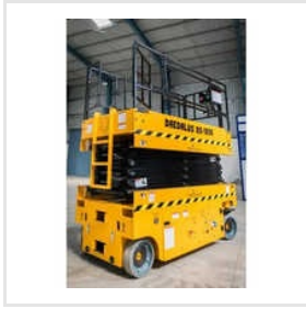
DS-1010 Daedalus Pushable Scissor Lift