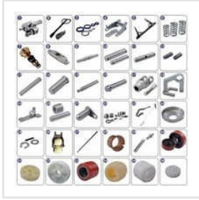
Hand Pallet Parts