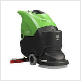
IPC CT40 Floor Scrubber