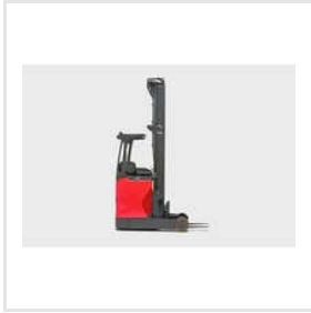
Linde Reach Trucks