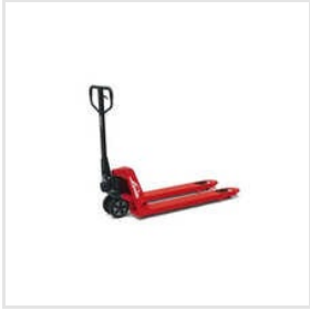
Hand Pallet Truck