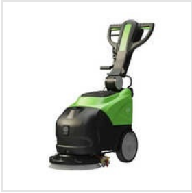
IPC CT30 Floor Scrubber