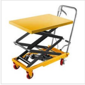
Scissor Lift Table