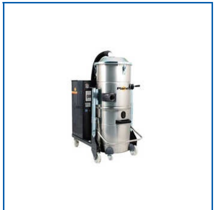
IPC PLANET 755 VACUUM CLEANER