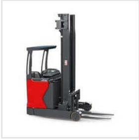
R14 Linde Reach Trucks