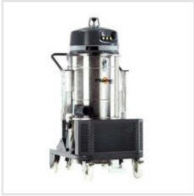
IPC Planet 200 Vacuum Cleaner