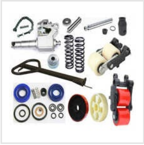
Hand Pallet Truck Parts