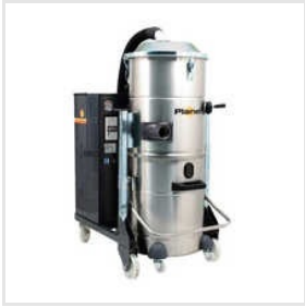
IPC Planet 755 Vacuum Cleaner