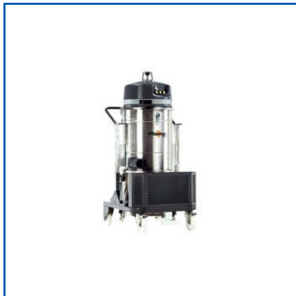
IPC PLANET 200 VACUUM CLEANER