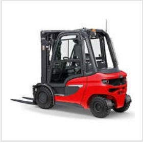
Linde Electric Forklift