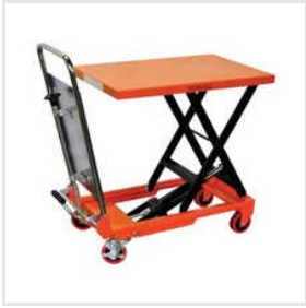
Hydraulic Scissor Lift Tables