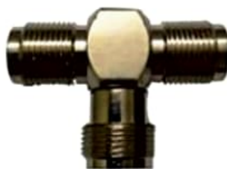
(F)- (F)- (F)