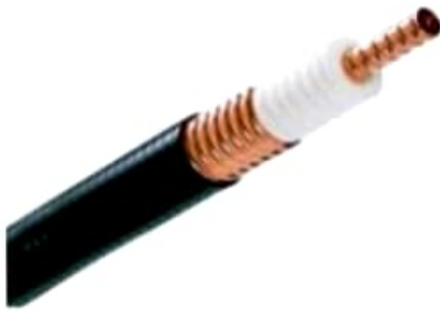
1/2" FLEXIBLE CABLE