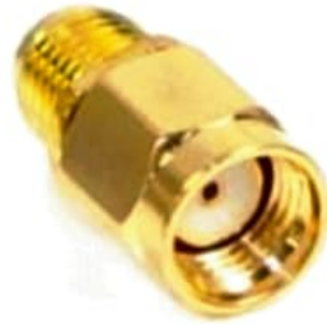
RP SMA (M) to SMA (F)