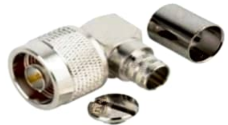
N (M) RIGHT ANGLE CONNECTOR (CRIMP)