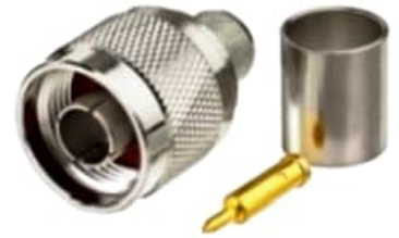
N MALE CONNECTOR FOR LMR200/LMR300/LMR400 (CRIMP TYPE)