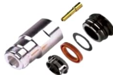
N FEMALE CONNECTOR FOR LMR200/LMR300/LMR400 (CLAMP TYPE)