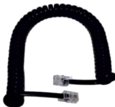
COIL CORD LANDLINE TELEPHONE WIRE