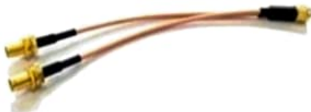
Y TYPE CABLE SMA (M)- SMA (F)- SMA (F)