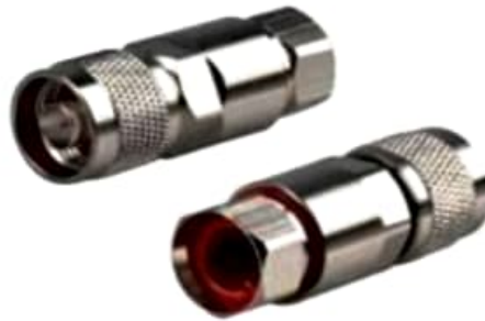
N (M) CONNECTOR FOR 1/2" FLEX AND SUPER FLEX CABLE (CLAMP)