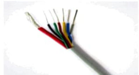
4+1 CCTV CABLE