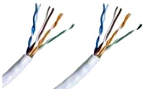
CAT5 NETWORKING CABLE