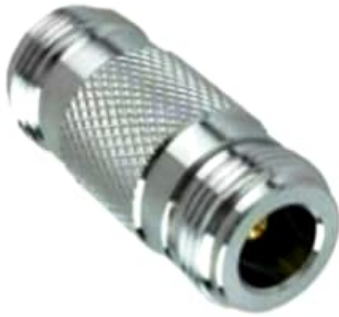
N (F) to N (F)