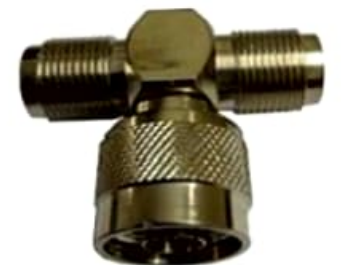
N (M)- N (F)- N (F)