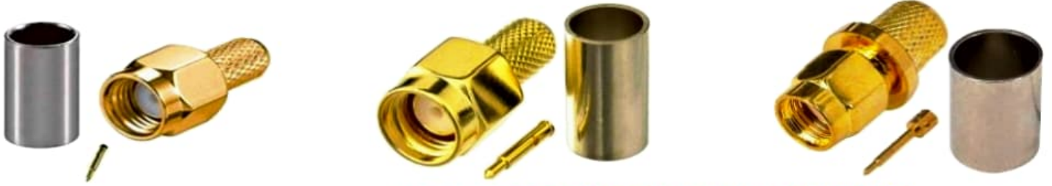
SMA MALE CONNECTOR FOR LMR200/LMR300/LMR400