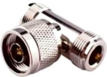
N (M)- (F)- (F)