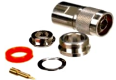
N MALE CONNECTOR FOR LMR200/LMR300/LMR400 (CLAMP TYPE)