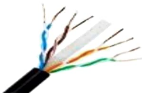
CAT6 NETWORKING CABLE