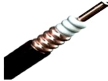
1/2" SUPE FLEXIBLE CABLE