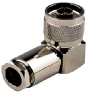
N (M) RIGHT ANGLE CONNECTOR (CLAMP)