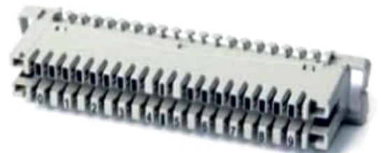
10 PAIR KRONE MODULE