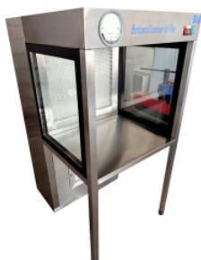
Stainless Steel Horizontal Laminar Air Flow