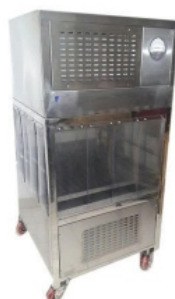
Mobile Laminar Air Flow