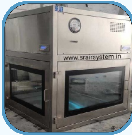
Dynamic Pass Box