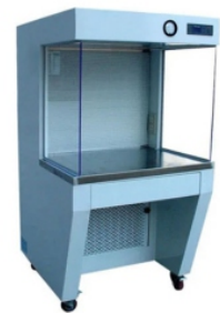
Laminar Air Flow Bench (Vertical-Horizontal)