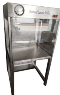
Horizontal Laminar Air Flow