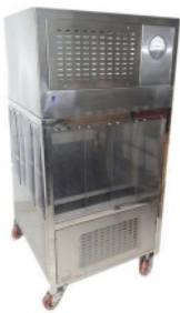
Mobile Laminar Air Flow