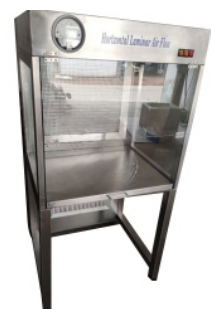
Horizontal Laminar Air Flow