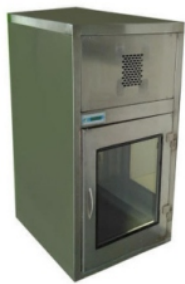
Dynamic Static Pass Box