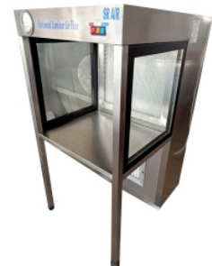
Stainless Steel Horizontal Laminar Air Flow