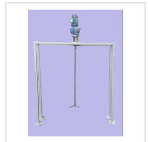
Industrial Mixing Agitator