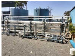
BOILER WATER TREATMENT PLANT

Automatic Chemical Dosing System, B-Series Electromagnetic Dosing Pump, Boiler Water Treatment Plant, CC3 Series Sandur Dosing Pump, Chemical Dosing Pumps, Chemical Dosing System, Chemical Mixing Agitator, Commercial Reverse Osmosis System, Compact Sewage Treatment Plant, Compact Waste Water Recycling Plant, DM Water Treatment Plant, Dialysis Water Plant, Diphragm Dosing Pump, Domestic Sewage Treatment Plant, Dosing Storage Tank, etc.