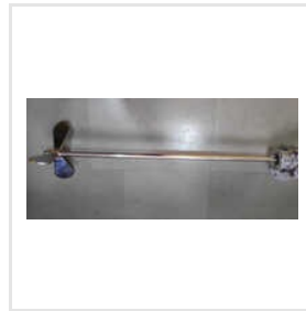
Industrial Mixers Agitator