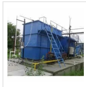
Grey Water Treatment Plant