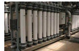
NANOFILTRATION WATER TREATMENT SYSTEM