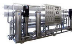
DIALYSIS WATER PLANT