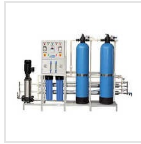
FRP RO Plant