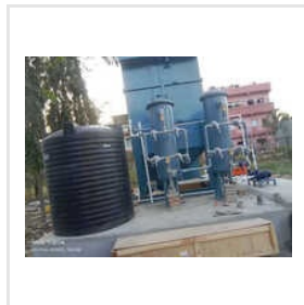
Domestic Sewage Treatment Plant