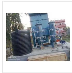
Pacakage Sewage Treatment Plant