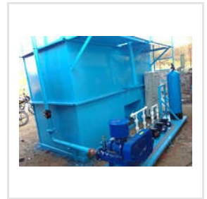
Prefabricated Sewage Water Treatment Plant