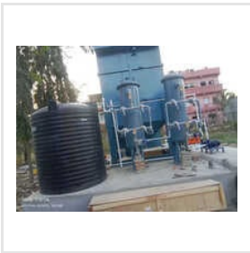
Compact Sewage Treatment Plant