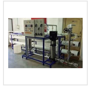
Industrial RO Plant