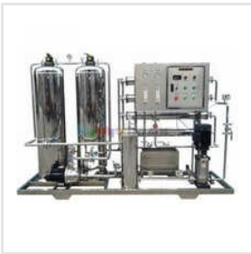
SS RO Plant