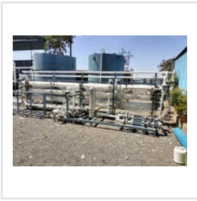
Seawater Desalination Plant