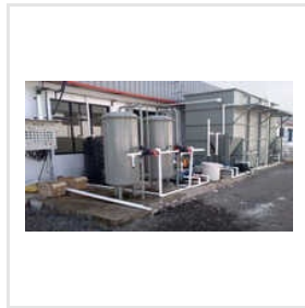
MbbR Based Sewage Treatment Plant