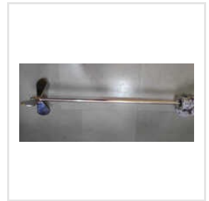
Paddle Blade Agitator