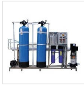
Commercial Reverse Osmosis System