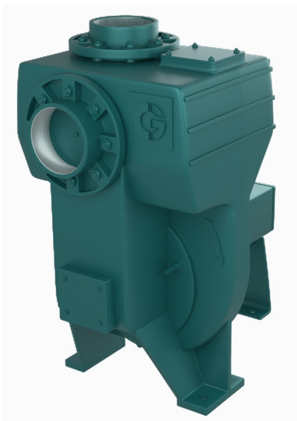
Bare Pump (10 to 25HP)