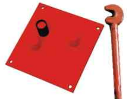
BAR BENDING PLATE & KEY