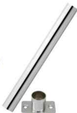
CROME PIPE & ACCESSORIES