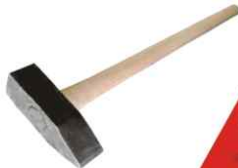
STONE BREAKING HAMMER