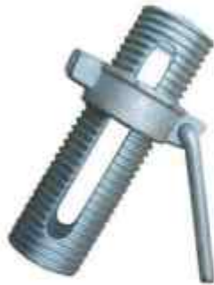
PROP SLEEVE WITH NUT