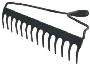
GARDEN RAKE (BOW BERROW)