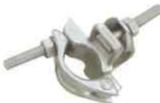
FORGED COUPLER FIXED