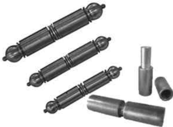
ROUND / DECORATIVE HINGES