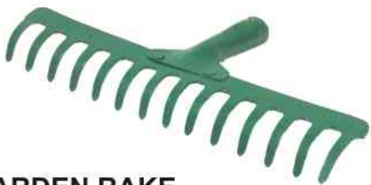
GARDEN RAKE (PLAIN)