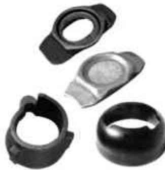
CUP LOCK ACCESSORIES