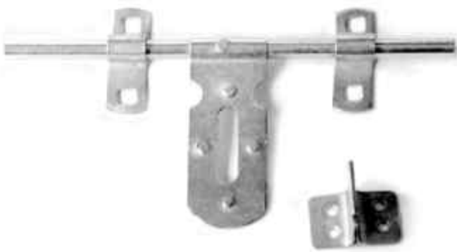
GATE LATCH (REVERTED)