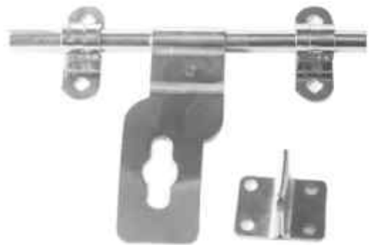
GATE LATCH (DELUX)