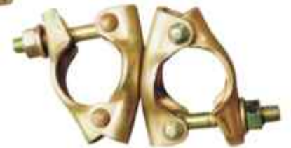
SHEET METAL COUPLER SWIVEL