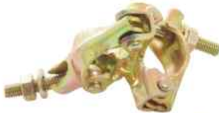
SHEET METAL COUPLER FIXED