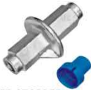
WATER STOPPER WITH PVC CAP