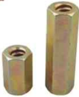
HEX NUT (TIE ROD CONNECTOR)