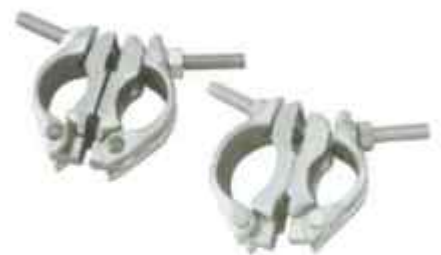
FORGED COUPLER SWIVEL