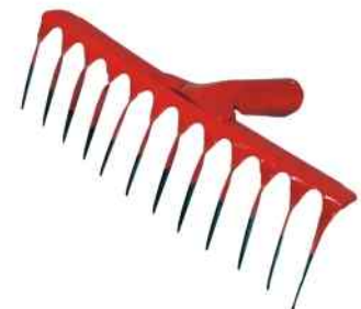
GARDEN RAKE (TWISTED)