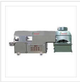
Semi Automatic Khakhra Making