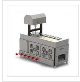
Automatic Chapati Machine