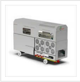
Automatic Roti Chapati Machine