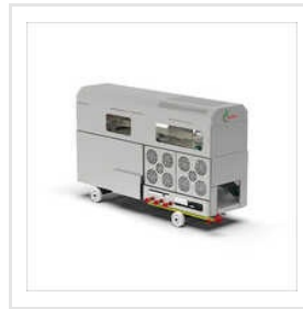
Chapati Making Machine