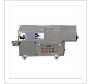
Khakhra Making Machine