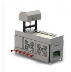
AUTOMATIC CHAPATI MACHINE