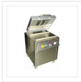
Single Chamber Vacuum Packing