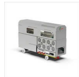
CHAPATI MAKING MACHINE