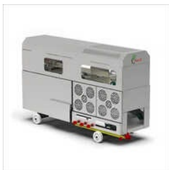
AUTOMATIC ROTI CHAPATI MACHINE

Automatic Chapati Machine, Automatic Khakhra Making Machine, Automatic Roti Chapati Machine, Chapati Making Machine, Flour Kneading Machine, Khakhra Making Machine, Khakhra Roasting Machine, Semi Automatic Khakhra Making Machine, Single Chamber Vacuum Packing Machine, etc.