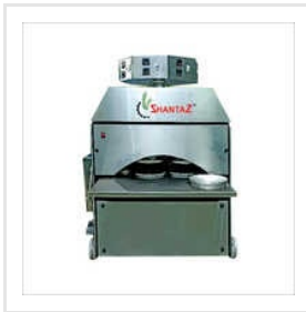
Khakhra Roasting Machine