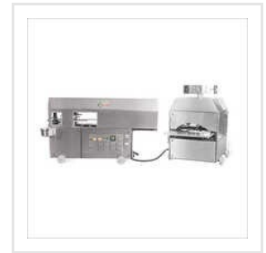
Automatic Khakhra Making Machine