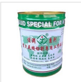
Jiarun JRIA EDM Coolant Gel