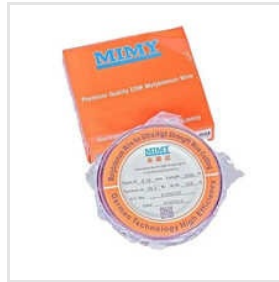
Mimy Premium Quality EDM Molybdenum Wire