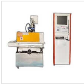
CNC Wire Cut EDM Machine