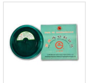
JDC Molybdenum Wire