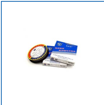
DIAMOND EDM MOLYBDENUM WIRE

150w 40 EDM Resistor, 18x1x325mm Screw Rod, 18x1x355mm Screw Rod, 18x2x375mm Screw Rod, 18x2x410mm Screw Rod, 18x2x430mm Screw Rod, etc.