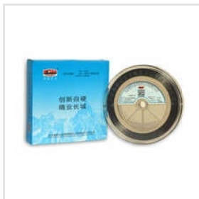
Great Wall Molybdenum Wire