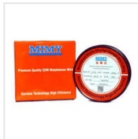
MIMY Molybdenum Wire