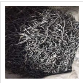
Industrial Tungsten Scrap