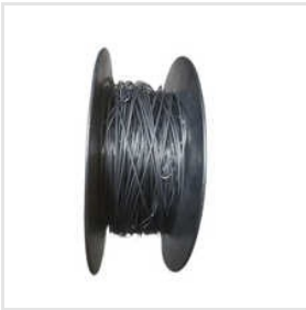
Pure Molybdenum Scrap