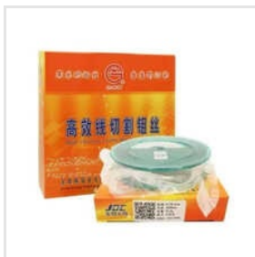
JDC High Efficiency EDM Molybdenum Wire