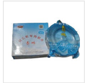
Great Wall EDM Molybdenum Wire