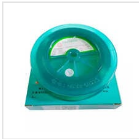
JDC EDM Molybdenum Wire