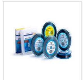
Honglu Molybdenum Wire