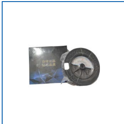
BLACK DIAMOND EDM MOLY WIRE