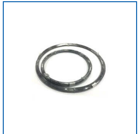
SPRAY MOLYBDENUM WIRES