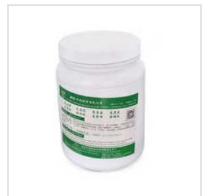
Jiarun JR3A EDM Coolant Gel