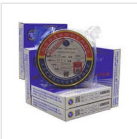
Diamond Molybdenum Wire