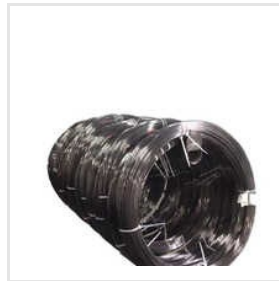
3.17 Mm And 2.31 Mm Molybdenum Spray