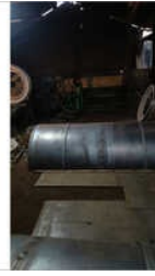
RCC Hume Pipe Making Machinery