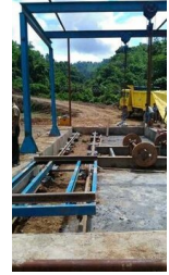
Np 3 Pipe Making Machine