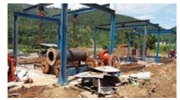
Concrete Pipe Making Machine