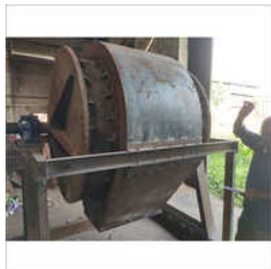
BALL MILL MACHINE

Ball Mill Machine, Bronze Ring, Concrete Pipe making Machine, Gear Parts, Np 2 pipe making machine, RCC Hume Pipe Making Machinery, Rcc Pipe Making Machine, cement pipe making machine, np 3 pipe making machine, etc.