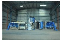
Rcc Pipe Making Machine