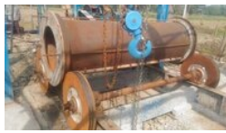
Np 2 Pipe Making Machine