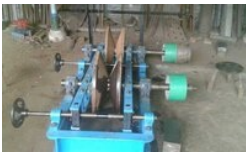
Cement Pipe Making Machine