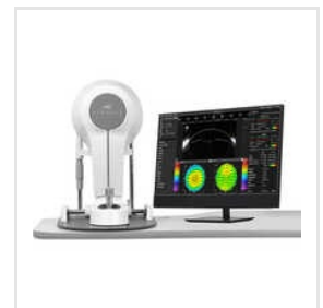
Scansys TA 517 Anterior Segment