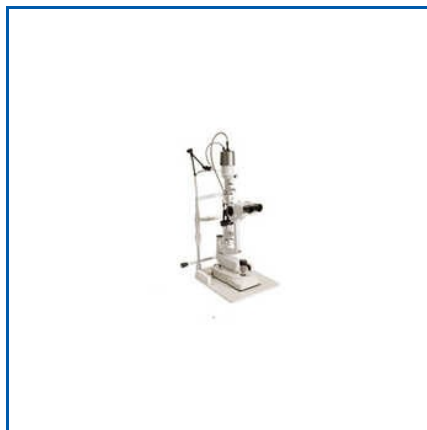
REXXAM DIGITAL PHOTO SLIT LAMP