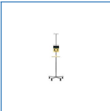
MEDICAL PHACOEMULSIFICATION SYSTEM

5G532 Multispot Laser Photocoagulator, Hospital Dry Eye Diagnostic System, Hospital Nd YAG Laser Machine, Hospital Spectral Domain OCT Machine, Hospital Specular Microscope, I Optik Auto Lensmeter, I Optik Auto Refractometer, I Optik Wireless Auto Phoropter, Medical Phacoemulsification System, Mediworks Digital Slit Lamp, Mediworks FC 162 Fundus Camera, Merilas A532 Single Spot Laser Photocoagulator, etc.