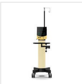
Oertli Faros Posterior Vitrectomy System