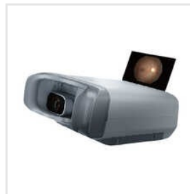
Mediworks FC 162 Fundus Camera