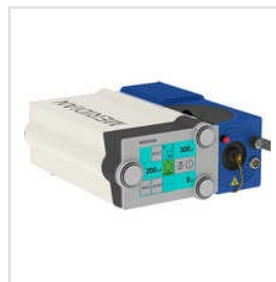
Merilas Shortpulse 532 Single Spot Laser