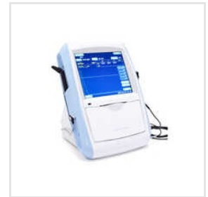
SP-1000AP A-Scan I Optik Auto Lensmeter