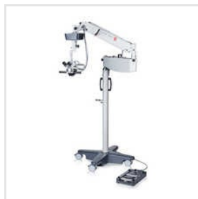
SOM 62 Ophthal Basic Surgical Microscope