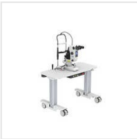
Hospital Nd YAG Laser Machine