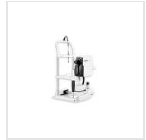
Hospital Spectral Domain OCT Machine