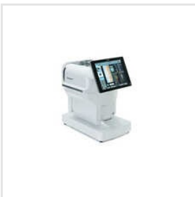
Hospital Specular Microscope