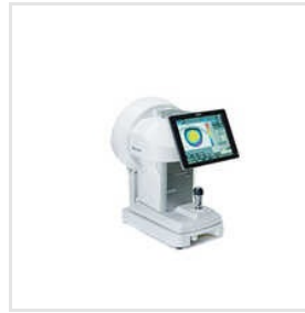
Rexxam RET 700 Corneal Topography