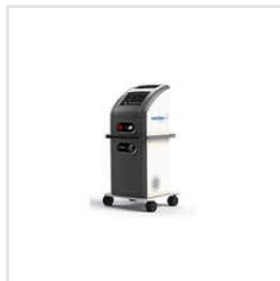
5G532 Multispot Laser Photocoagulator