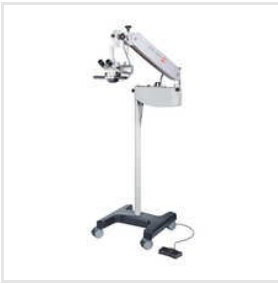
SOM 62 Ophthal Basic Surgical Microscope