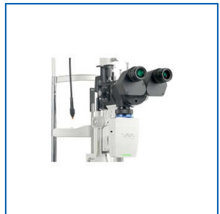
MEDIWORKS DIGITAL SLIT LAMP