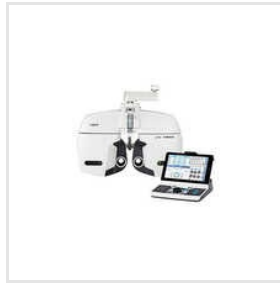
I Optik Wireless Auto Phoropter