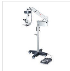
SOM 62 Ophthal Advanced Surgical