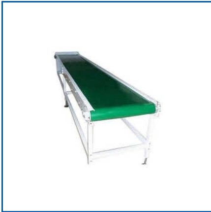
INDUSTRIAL BELT CONVEYOR

Industrial Belt Conveyor, Industrial Centrifugal Blower, Industrial Packing Machine, Industrial Seed Cleaner Machine, etc.