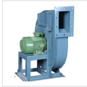
Industrial Centrifugal Blower