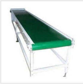
Industrial Belt Conveyor