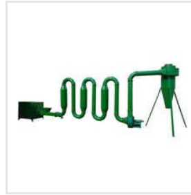
Industrial Seed Cleaner Machine