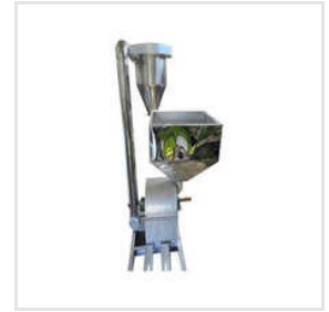
Industrial Packing Machine