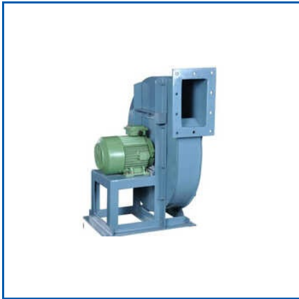
INDUSTRIAL CENTRIFUGAL BLOWER