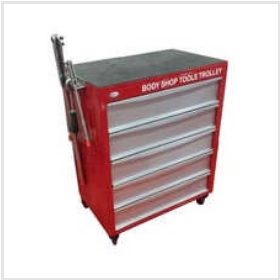
Body Shop Tools Trolley With Tools