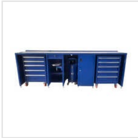
Integrated Workstation For 2 Tech