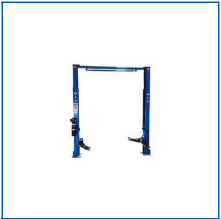
TWO POST LIFT CLEAR FLOOR