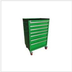
7 Drawers Tools Trolley