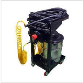
Electric Portable Raptor Vacuum Dust