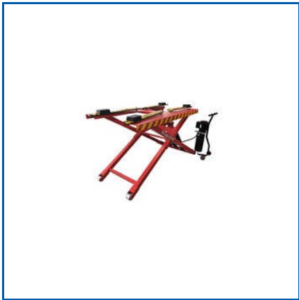
LOW RISE SCISSOR LIFT