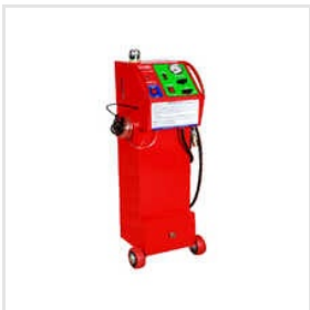
Oil Disposer Folding Type