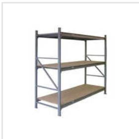
Heavy Duty Spare Parts Rack