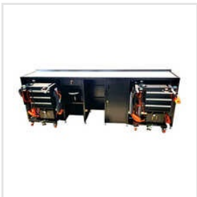
Integrated Workstation For