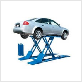
Floor Mounted Single Scissor Lift