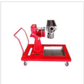
Engine Service Fixture