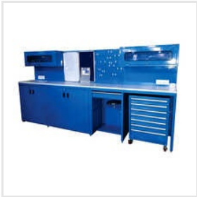
Integrated Workstation For EV