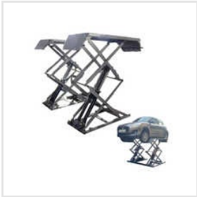
Floor Mounted Dual Scissor Lift