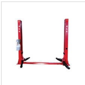
Two Post Lift Base Floor