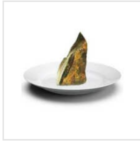
Industrial Mimosa Solid Extract