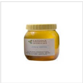
Polymeric Acrylic Syntan