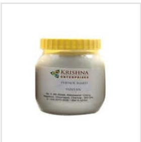
Phenolic Condensate Anionic Syntan