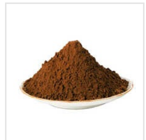
Quebracho Extract ATO Powder