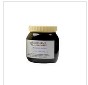
Fish Oil Based Fat