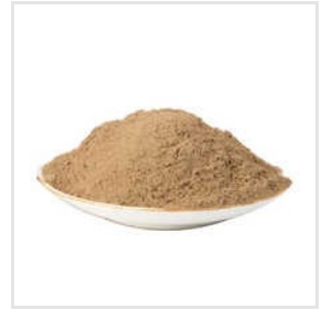
Mimosa GS Powder