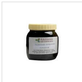
Phosphoric Esters Based Anionic