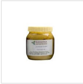
Lecithin Based With Special Emulsifiers