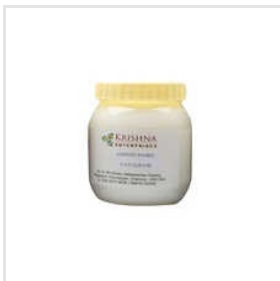
Amides Based Fatliquor