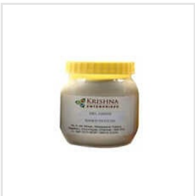
Melamine Condensate Anionic Syntan