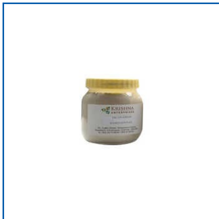
MELAMINE DYCIANDIAMIDE CONDENSATE ANIONIC SYNTAN