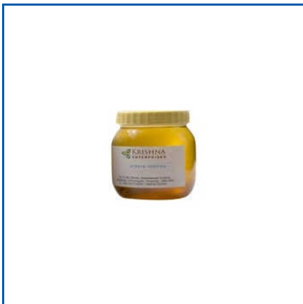
POLYMERIC ACRYLIC SYNTAN

Amides Based Fatliquor, Fish Oil Based Fat, Industrial Mimosa Solid Extract, Leather Syntans, Lecithin Based with Special Emulsifiers, Melamine Condensate Anionic Syntan, Melamine Dyciandiamide Condensate Anionic Syntan, Mimosa GS Powder, Myrobalan Powder, Phenolic Condensate Anionic Syntan, Phosphoric Esters Based Anionic Fatliquor, Polymeric Acrylic Syntan, Quebracho Extract ATO Powder, Syntans Chemical, Synthetic Fatliquor, etc.