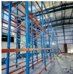
HEAVY DUTY MILD STEEL RACK