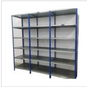
Industrial Mild Steel Storage Rack