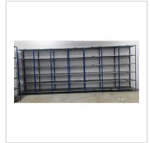
8 Feet Mild Steel Slotted Angle Rack