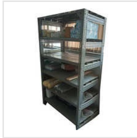
Industrial Mild Steel Slotted Angle Rack