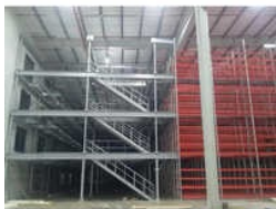
MILD STEEL MEZZANINE STORAGE RACK

15 Feet Heavy Duty Mild Steel Rack, 8 Feet Mild Steel Slotted Angle Rack, Heavy Duty Mild Steel Rack, Industrial Mild Steel Slotted Angle Rack, Industrial Mild Steel Storage Rack, Mild Steel Mezzanine Storage Rack, etc.