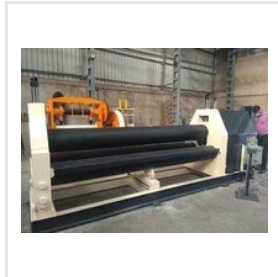
MECHANICAL PLATE ROLLING MACHINE