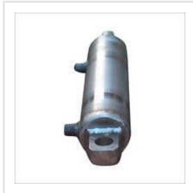
Metal Hydraulic Cylinders