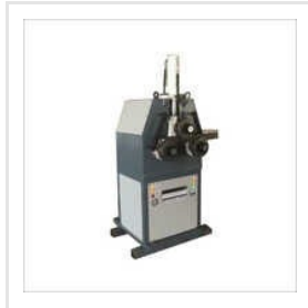
Section Bending Machine