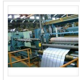
Sheet Metal Coil Slitting Machine