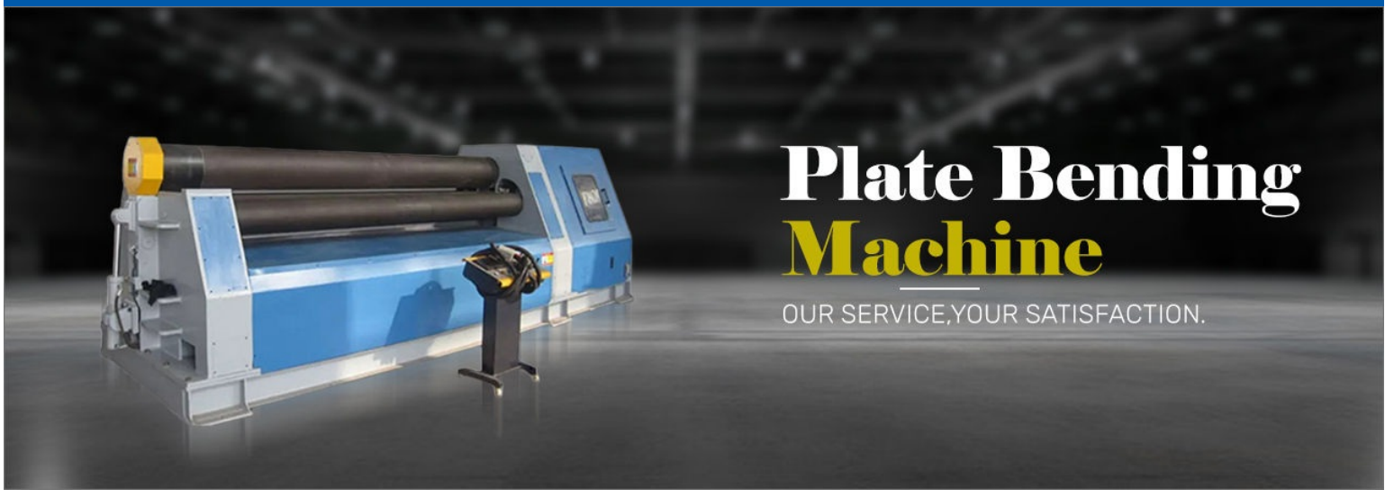
Plate Bending Machine