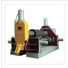
Hydraulic Plate Bending Machine