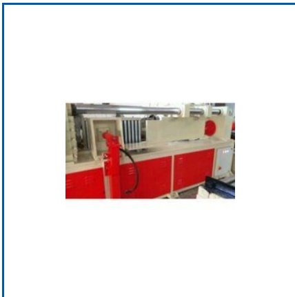
ALUMINIUM SCALPING MACHINE

2 Hi Hot Rolling Mills, 4 Hi Cold Rolling Mills, Aluminium Scalping Machine, C Type 800 Tons Twin Cylinder Hydraulic Press, Circulating Lubrication System, Coil Strip Cold Rolling Mill Machine, H Beam Flange Straightening Machines, Etc.