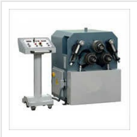
Hydraulic Section Bending Machine