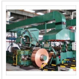
Coil Strip Cold Rolling Mill Machine