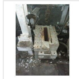
Rolling Mill Moulds