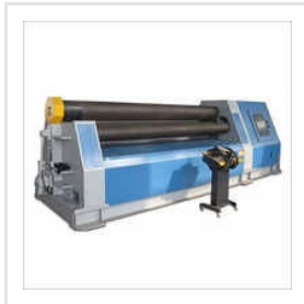
Hydraulic Plate Rolling Machine