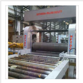
2 HI HOT ROLLING MILLS