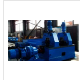
PEB H BEAM STRAIGHTENING