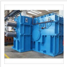
Rolling Mill Lubrication System