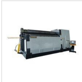
NC Operated Hydraulic Plate Rolling Machine