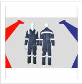
Cotton Flame Retardant Coverall