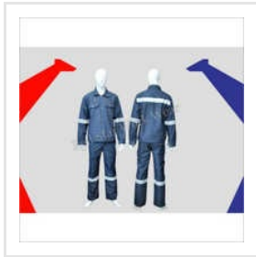
Denim Safety Pant Jacket