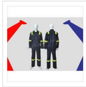
Inherent Flame Retardant Pant Jacket