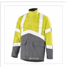
Flame Retardant Cover All Set