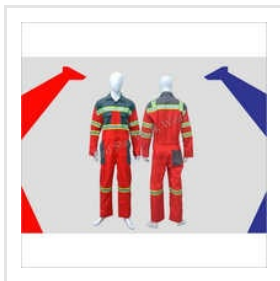
Industrial Worker Coverall