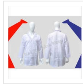
White Cotton Lab Coat