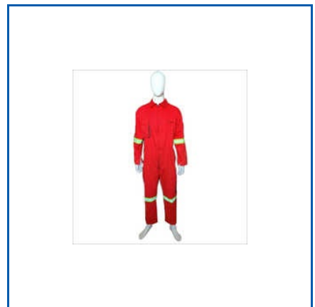
RED BOILER SUIT