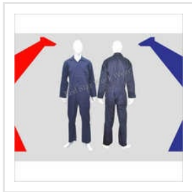
Navy Blue Industrial Boiler Suit