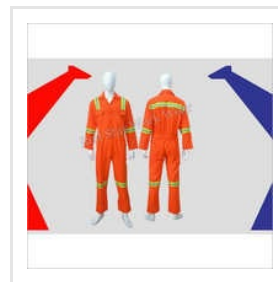
Orange Industrial Cotton Coverall