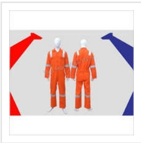
Full Body Cover Boiler Suit