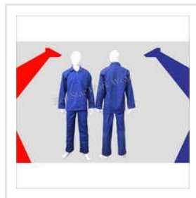
Industrial Poly Cotton Pant Jacket