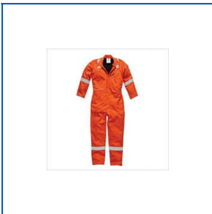
REFLECTIVE INDUSTRIAL COTTON BOILER SUIT

Cotton Coverall, Cotton Flame Retardant Coverall, Denim Safety Pant Jacket, Flame Retardant Cover All Set, Full Body Cover Boiler Suit, IFR Cover All, Industrial Work Wear Boiler Suit, Industrial Poly Cotton Pant Jacket, Industrial Woerker Coverall, Industrial Work Wear Bib Pants, Inherent Flame Retardant Pant Jacket, Medical Scrubs, Navy Blue Cotton Industrial Boiler Suit, Navy Blue Industrial Boiler Suit, Orange Industrial Cotton Coverall, etc.