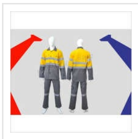
Unisex Industrial Cotton Pant Jacket