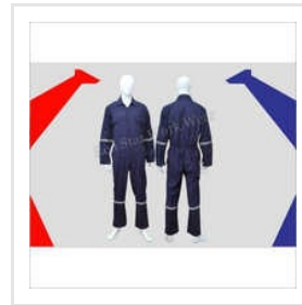
Navy Blue Cotton Industrial Boiler Suit