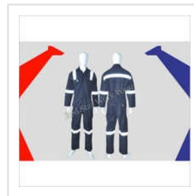
IFR Cover All