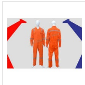
Industrial Work Wear Boiler Suit