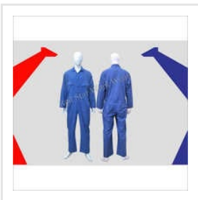
Royal Blue Cotton Coverall