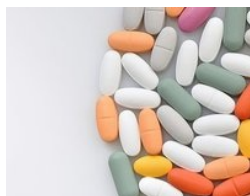
L 100 55 D

Aqueous Enteric Coating, Aqueous Enteric Coating Polymer, Aqueous Film Coating, Aqueous Film Coating Powder, Aqueous Moisture Barrier Film Coating Powder, Aqueous Tablet Coating Powder, Aqueous Tablet Film Coating, Enteric Coating Material, Enteric Coating Non Aqueous Solvent Based, Enteric Coating Powder, HPMC Based Coating Material, L 100, L 100 55 D, L 30 D, Methacrylic Acid Copolymer, etc.