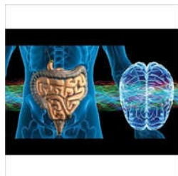
Tablet Enteric Coating Powder