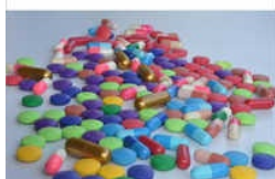
Aqueous Tablet Coating Powder