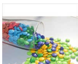
Non Aqueous Coating Powder