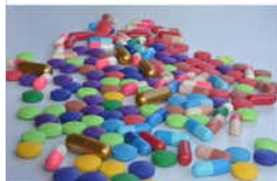
Water Film Coating Powder