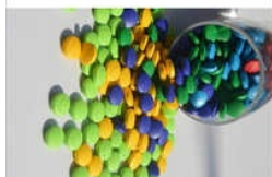
Pharmaceutical Coating Powder