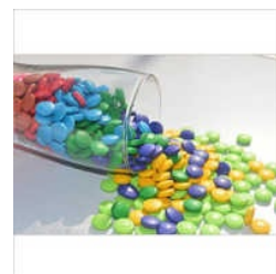
ENTERIC COATING NON AQUEOUS SOLVENT BASED