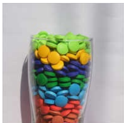
Enteric Coating Powder