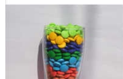
Aqueous Enteric Coating