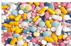
Aqueous Film Coating Powder