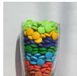
Aqueous Enteric Coating Polymer