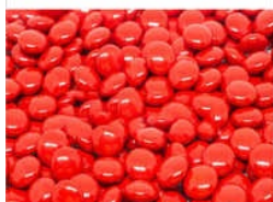
Tablet Coating Film