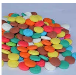
Aqueous Tablet Film Coating