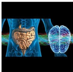
Solvent Base Enteric Coating