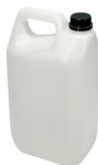
L 30 D