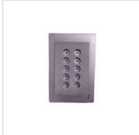
Aluminium Blister Packaging Machine