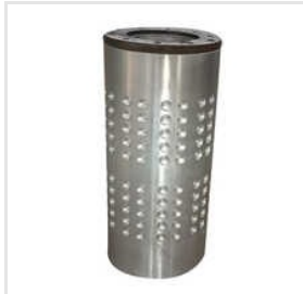
150mm Blister Pack Machine Sealing Roller