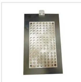
Blister Machine Change Parts