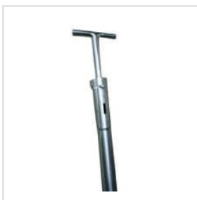
Vertical Sampling Rod