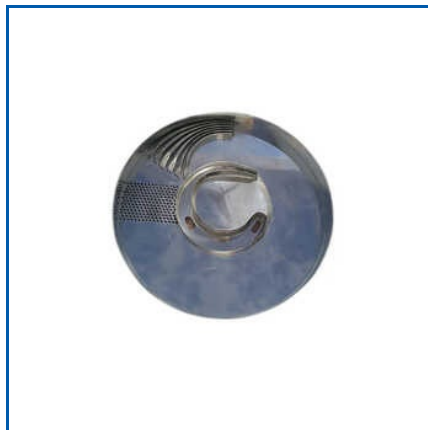
STRIP PACKING BOWL DISC