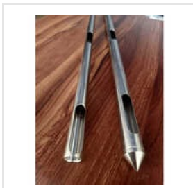
Dies Powder Sampling Rod