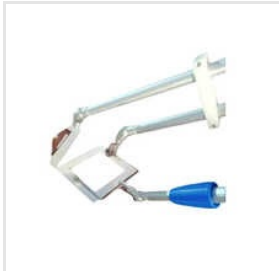
Swabbing Fishing Rods