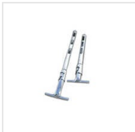
SS316 L Sampling Rod