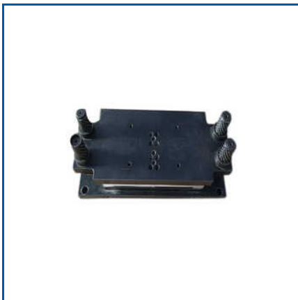
BLISTER PACK MACHINE CUTTING TOOLS

150mm Blister Pack Machine Sealing Roller, 75mm Blister Pack Machine Stereo Roller, Aluminium Blister Packaging Machine Change Part, Aluminium Change Part Of Blister Packing Machine, Blister Machine Change Parts, Blister Pack Machine Cutting Tools, Blister Packing Machine Filling Plate, Dies Powder Sampling Rod, Forming Heater Roller Assembly, Microbiological Telescopic Swab Sampler, SS316 L Sampling Rod, SS316 Liquid Sampler, Sieve Storage Trolley, Stainless Steel Forming Tool, Strip Packing Bowl Disc, etc.