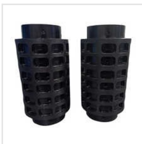
Strip Packing Machine Sealing Roller