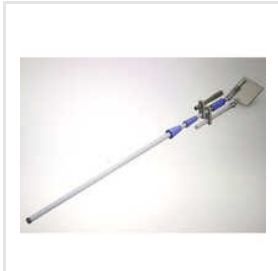
Microbiological Telescopic Swab