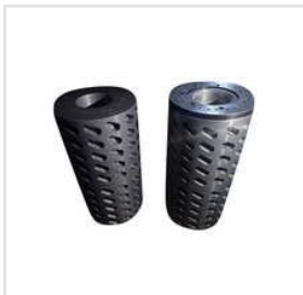
Aluminium Change Part Of Blister Packing