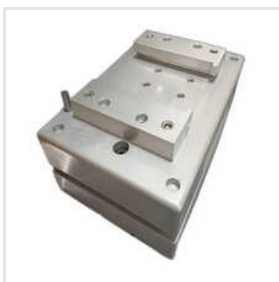
Stainless Steel Forming Tool