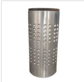
75mm Blister Pack Machine Stereo Roller