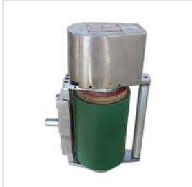
Forming Heater Roller Assembly