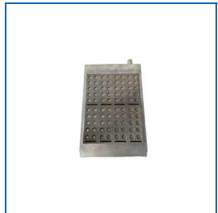
BLISTER PACKING MACHINE FILLING PLATE