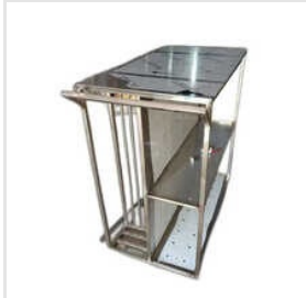
Sieve Storage Trolley