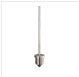
SS316 Liquid Sampler