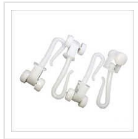
PVC Runner Curtain Hook