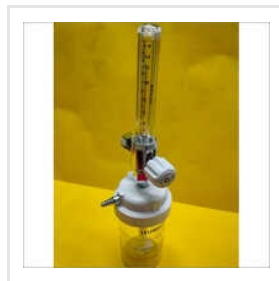
Oxygen BPC Flowmeter