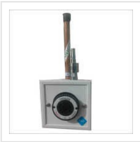
BS Type Oxygen Outlet Point