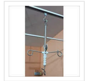
Hospital IV Hanger