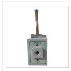
Amico Type Oxygen Outlet Point