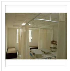
Hospital Cubicle Curtain Track