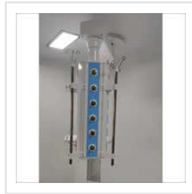
Operation Theatre Pendant