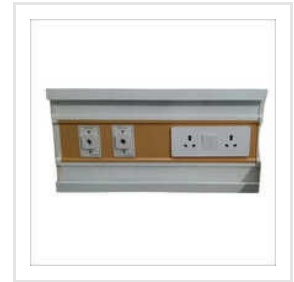
Hospital Bed Head Panel