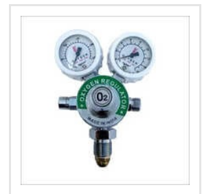
SSDG Oxygen Mox Regulator