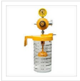
2000MI Ward Vacuum Regulator Unit