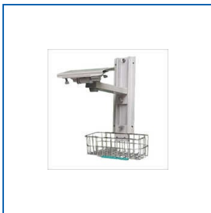
CARDIAC MONITOR STAND