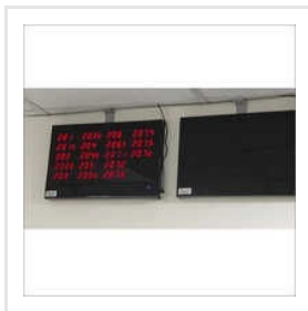
Nurse Call Bell System