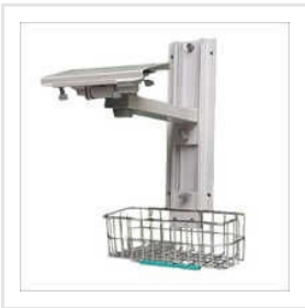
Cardiac Monitor Stand