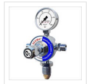
Single Gauge Oxygen Gas Regulator