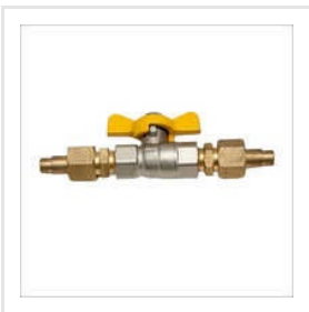
Gas Pipeline Isolation Ball Valve