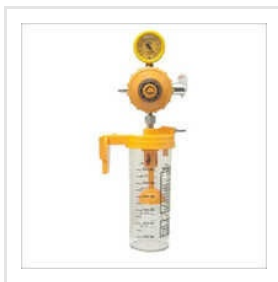
600MI Ward Vacuum Regulator Unit