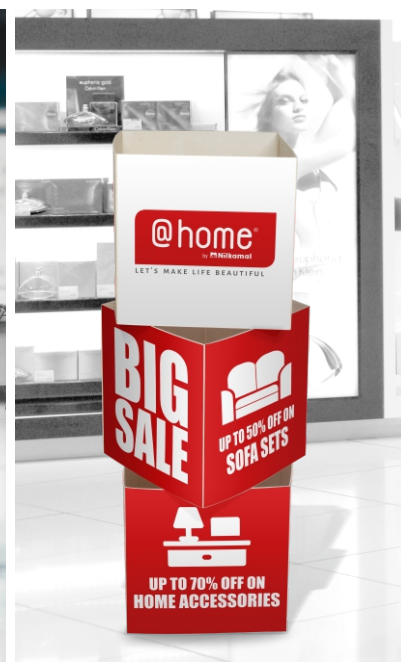
MULTI SIDED PROMOTIONAL DISPLAY