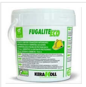
Kerakoll Fugalite Eco Epoxy Tile Grout