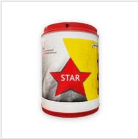
Starproof Aquacrete Waterproofing