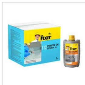
Dr Fixit Pidifin 2K Waterproofing