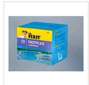
Dr Fixit Fastflex