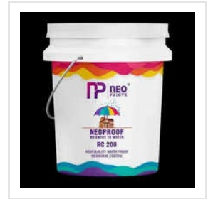
RC200 Neo Proof Waterproofing