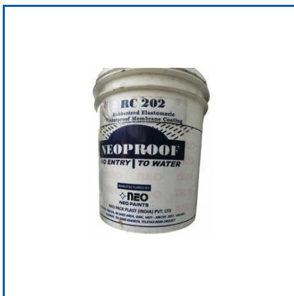
RC202 NEOPROOF WATERPROOFING CHEMICAL

113 Fastflex Dr Fixit Waterproofing Chemical, 162 Dr Fixit Polyplus CP Waterproofing Chemical, 301 Dr Fixit Pidicrete URP Waterproofing Chemical, 304 Dr Fixit Powercrete Waterproofing Chemical, 806 Dr Fixit Piditop 333 Non Metallic Floor Hardener, Acrylic Coatings, Araldite Aradur 140 in, Araldite Epoxy Resin Hardener, Asian Smart Care Bitumen 20 L, CICO No1 Yellow Waterproofing Compound, CICO P 151 Tapecrete Waterproofing Chemical, CICO Tapecrete P 151, Liquid, Packaging, Choksey Flex Seal Epdm, etc.