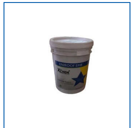
ENIROOF EMB XCHEM WATERPROOFING CHEMICAL