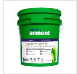
Myk Aremment Latex 45