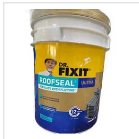
Dr.Fixit Roof Seal Ultra