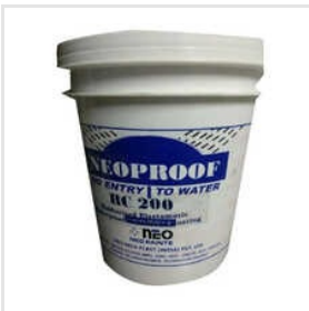
Neoproof RC 200 Waterproofing