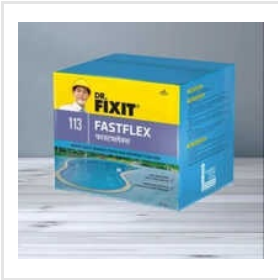
113 Fastflex Dr Fixit Waterproofing