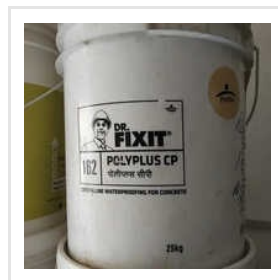
162 Dr Fixit Polyplus CP Waterproofing