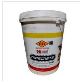
CICO P 151 Tapecrete Waterproofing