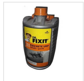
301 Dr Fixit Pidicrete URP Waterproofing