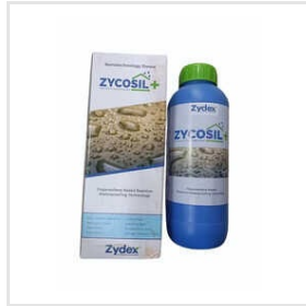
Zydex Zycosil Plus Waterproofing