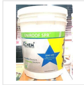
Xchem Eniroof SPR