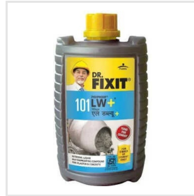
Dr Fixit Waterproofing Chemicals