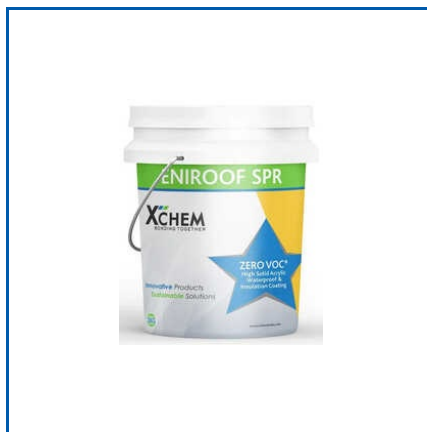
ENIROOF SPR XCHEM ZERO VAC WATERPROOFING CHEMICAL