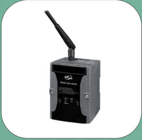
Intelligent IOT Converter