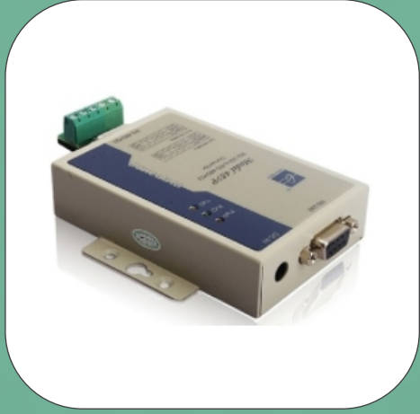
Interface Converter (Model485P)