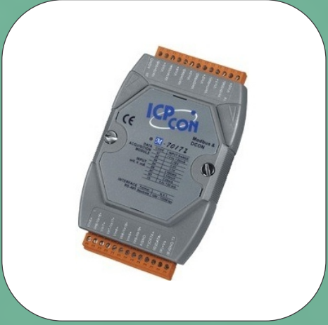
Modbus Analog DAS Module