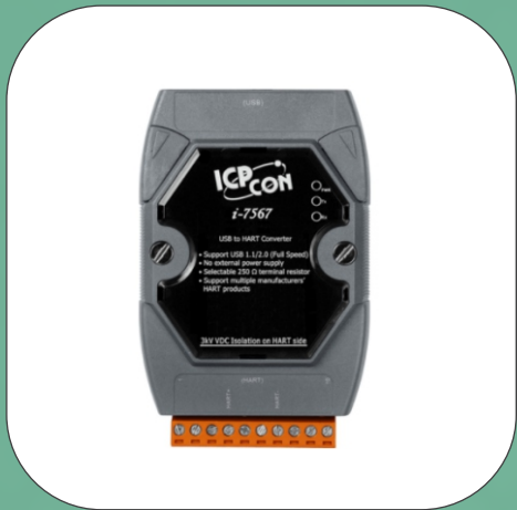
USB to HART