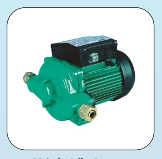
PB Series Inline Pressure Booster