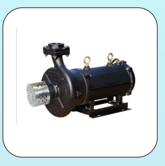
3 Phase Horizontal Open Well Submersible Pumpset