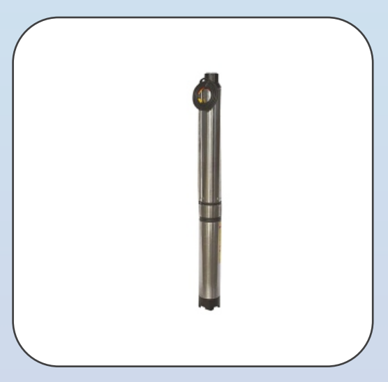
5 HP Borewell Submersible Pumpset