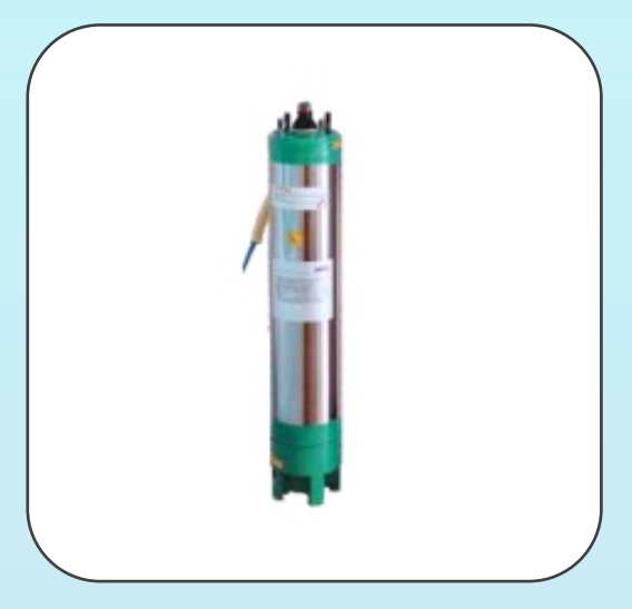
150 MM Borewell Submersible Pumpset