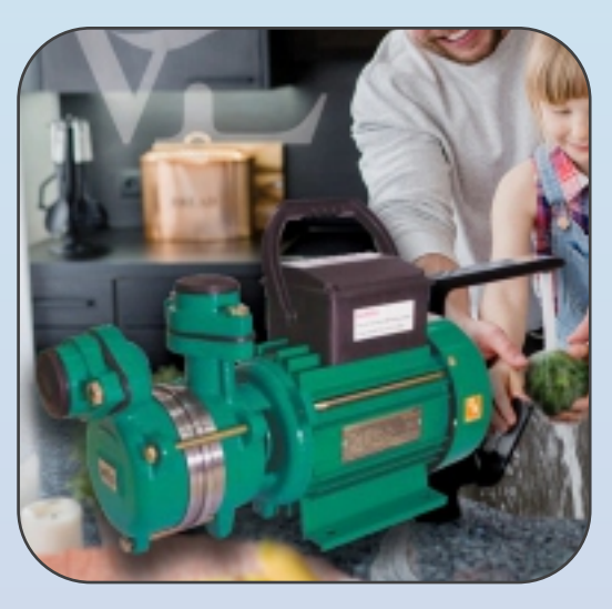
WHS-M Self Priming High Suction Pump