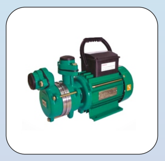
WHS-M Series Self-Priming High Suction Pumpset