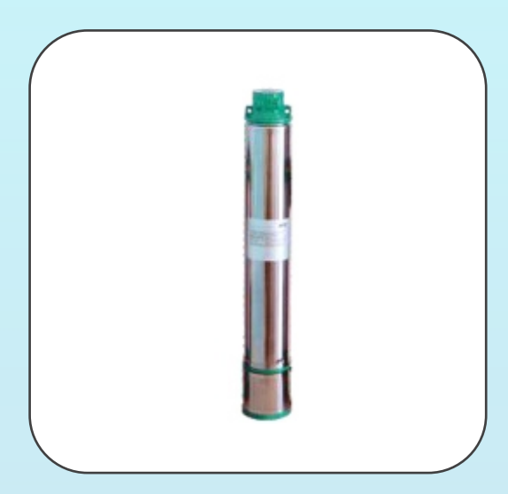
175 MM Borewell Submersible Pumpset