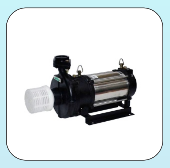
1 Phase Horizontal Open Well Submersible Pumpset