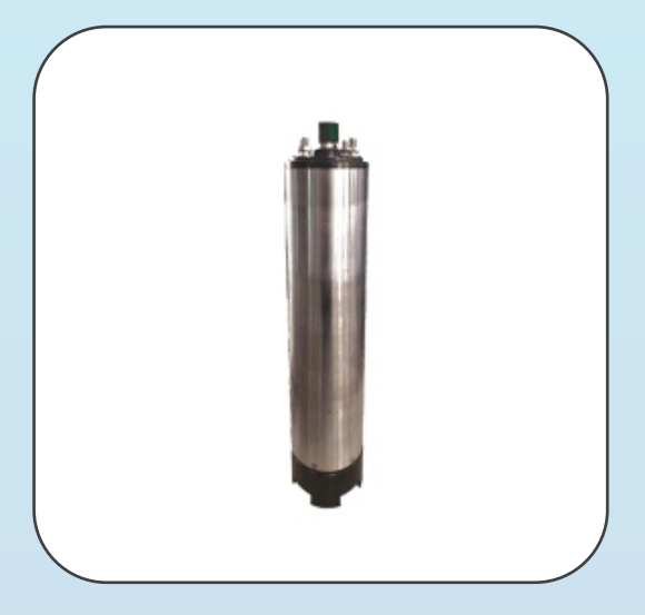
4 Inch Borewell Submersible Pumpset