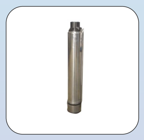
SS Borewell Submersible Pumpset