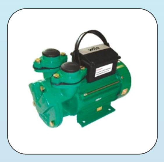
WHS-V Series Self-Priming High Suction Pumpset