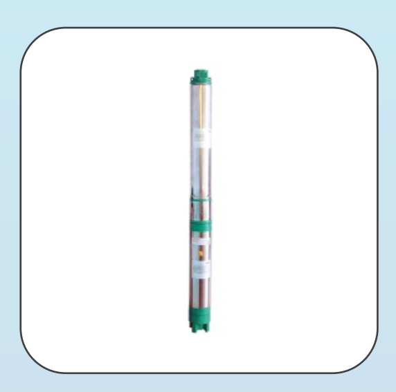
200 MM Borewell Submersible Pumpset