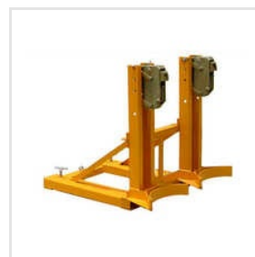
Material Handling Parrot Beak