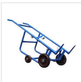
Drum Handler Trolley