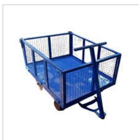
Platform Trolley With Cage