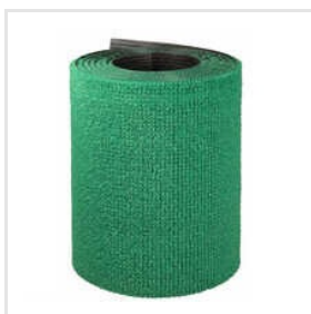
Lite Duro Turf Mat