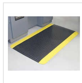
Electric Panel Mat