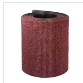
Lite Plus Duro Turf Mat