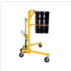
Drum Truck Loader