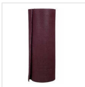
Duro Wipe HD Mat