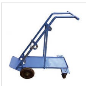
Double Cylinder Trolley