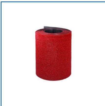
PREMIUM DURO TURF MAT

Alkon Waste Bins, Aluminium Scaffolding, Aluminium Scaffolding Ladder, Aluminium Tilttable Ladder, Aluminium Tilttable Tower Ladder, Aluminum Extendable Self Supporting Ladder, Aluminum Folding Ladder, Asbestos Free Gasket, Bale Trolley, Black Adjustable Leg Pads, Cage Trolley, Castor Wheel, Chain Pulley Block, Cylinder Trolley, Double Wheel Barrow, etc.