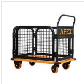
Apex Cage Trolley