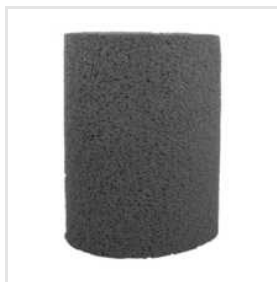
Heavy Duty Duro Soft Ultra Mat