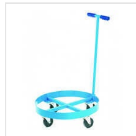
Drum Dollies-Barrel Moving Hand Trolley