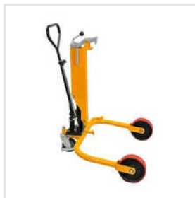
Hydraulic Drum Lifter Trolley