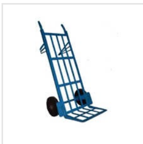
Textile Bales Luggage Trolley