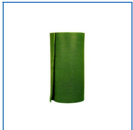
DURO WIPE MAT