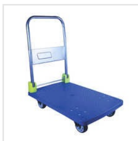
Supo IVY - Low Carbon Platform Trolley