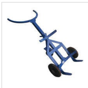
U-Type Drum Trolley