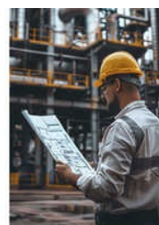
Commercial Operation And Maintenance