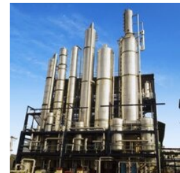
2G ETHANOL PRODUCTION DISTILLERY PLANT (1)