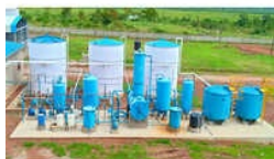
Fully Automatic Water Treatment Plant