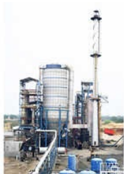
Spent Wash Spray Dryer