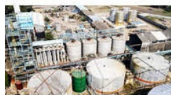
Commercial EPC Project Services