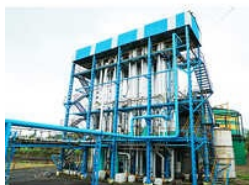
Falling Film And Forced Circulation