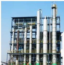
2G ETHANOL PRODUCTION DISTILLERY PLANT (2)

2G Ethanol Production Distillery Plant (1), 2G Ethanol Production Distillery Plant (2), Atmospheric Fluidized Based Combustion Boiler, AutoCAD 3D Aspen HYSYS Solid Work Services, Automatic Condensate Polishing Unit, Biomass Fired Boiler, CBG Plant, CPU Plant, Cane Based Distillery Plant, Cladded Pressure Vessel, etc.