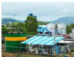
Automatic Condensate Polishing Unit