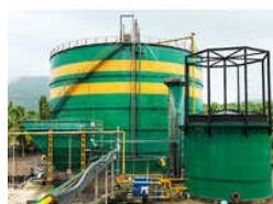
High Efficiency Digestion And Biogas