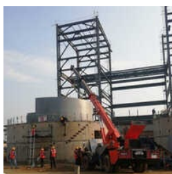
Construction And Installation Work