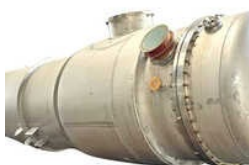
Metal Heat Exchanger