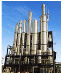
CANE BASED DISTILLERY PLANT