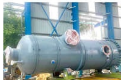
Cladded Pressure Vessel