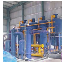
Fully Automatic Compressed Biogas