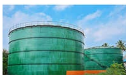
Industrial Molasses Handling Tank