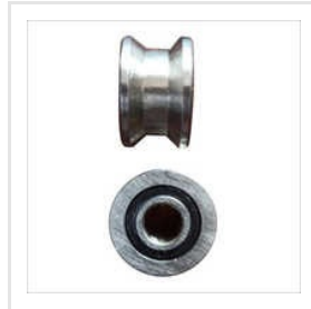
CNC Machine Guide Block Bearing