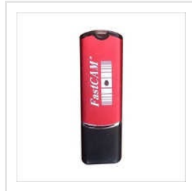
2 GB CNC Plasma Cutting Software