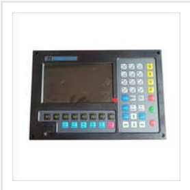
Single Phase CNC Machine Controller