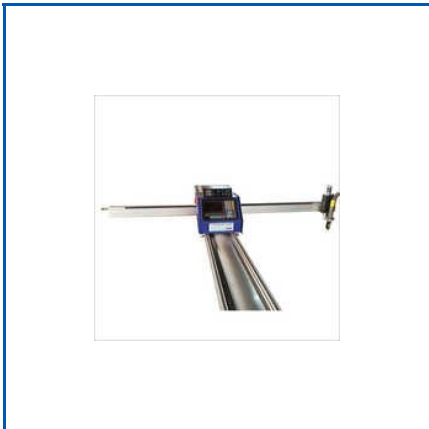
PORTABLE SINGLE ARM CNC PLASMA CUTTING MACHINE

2 GB CNC Plasma Cutting Software, 2 Inch Copper Hypertherm Plasma Consumables, 220 V Plasma Torch Height Controller, 220 V Stepper Motor Drives, 25mm CNC Plasma Cutting Torch Head, 3.6 V Leadshine Hybrid Stepper Motor, Automatic CNC Laser Cutting Machine, CNC Machine Guide Block Bearing, Cut 160 IGBT Semi Automatic Inverter Plasma Cutting Machine, Gantry CNC Plasma Cutting Machine, Industrial CNC Plasma Cutting Services, Photoelectric Sensor Switch, Portable Single Arm CNC Plasma Cutting Machine, Single Phase CNC Machine Controller, Stainless Steel Laser Cutting Services, etc.