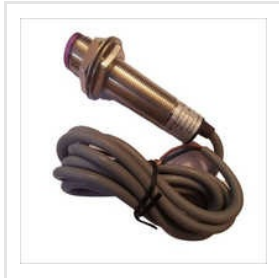
Photoelectric Sensor Switch