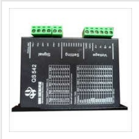
220 V Stepper Motor Drives