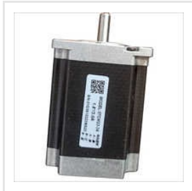
3.6 V Leadshine Hybrid Stepper Motor