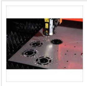
Industrial CNC Plasma Cutting Services