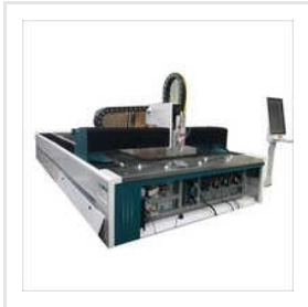
Automatic CNC Laser Cutting Machine