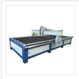
Gantry CNC Plasma Cutting Machine