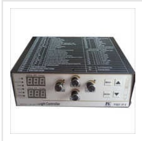
220 V Plasma Torch Height Controller