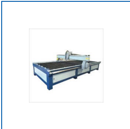
GANTRY CNC PLASMA CUTTING MACHINE