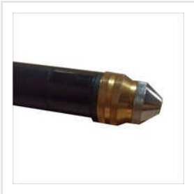
25mm CNC Plasma Cutting Torch Head