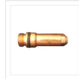
2 Inch Copper Hypertherm Plasma