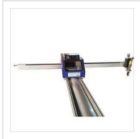
Portable Single Arm CNC Plasma Cutting