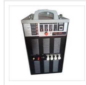
Cut 160 IGBT Semi Automatic Inverter