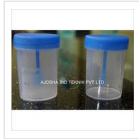
Stool Urine Sample Container