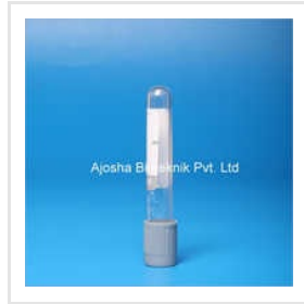
PT Blood Tube