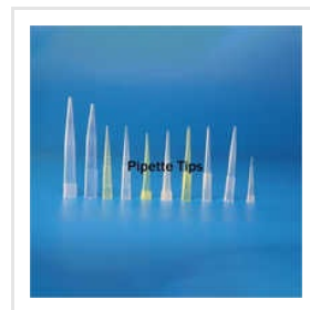
Disposable Pipette Tips