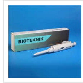
Bioteknik Micro Pipette