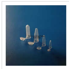
Micro Centrifuge Tube