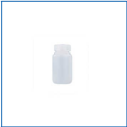
LAB BUFFER BOTTLES