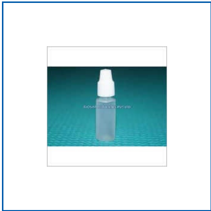
3 ML BUFFER BOTTLES

3 ml Buffer Bottles, 30 ml Urine Container, 60 ml Urine Container, Bioteknik Micro Pipette, Disposable Ampoules, Disposable ESR Pipette, Disposable Pipette Tips, Disposable Surgical Face Mask, Dropper Bottles, ESR Tube, Embedding Rings, Glucose Tube, Heparin Tube, Lab Buffer Bottles, Micro Centrifuge Tube, etc.