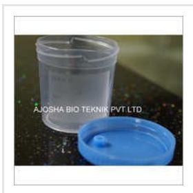
Sputum Urine Container