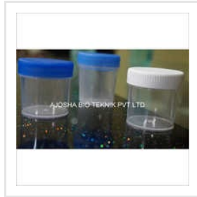
30 MI Urine Container